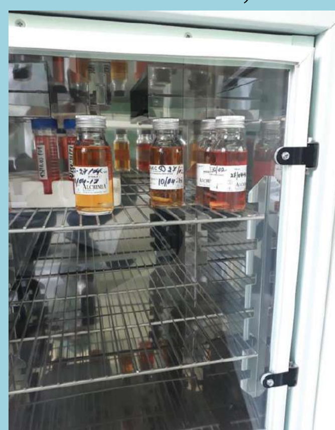
Figure 3. Incubator for store cornea.

Results: During the study period, 306 corneas were taken from 153 donors (69,8% male, 30,2% female), with a mean age of donors 59,4 years (18,3 years SD) and between 18 and 91 years old. Donors were from forensic medicine (23,5%), public hospitals (67,6%) and multi-organ donors (7,1%). The most common causes of the donor deaths were the cardiovascular disease, trauma and the cerebrovascular diseases. The average storage time increased from 3,5 to 11,8 days, from when the culture medium replaced hypothermic storage. Invalidation of the corneas was in 22,8% of cases, of which were determined by serological infections ( HBsAg - positive, HCV positive, HIV / AIDS) - 15%, and biological contamination occurred in 7,8% of all donor corneas. The most common bacterial and fungal isolates were coagulase-negative staphylococci and Candida spp., respectively. A significant decrease in the contamination rate was identified during the study years. Overall, 77,2% of the corneal tissue taken was used for corneal transplantation (74,8% for penetrating keratoplasty, 2,1% for lamellar keratoplasty and 1,3% for unspecified transplants) and 22,8% were destroyed. The most common reasons for tissue settlement were biological contamination, serology, and endothelial cell integrity assessment.