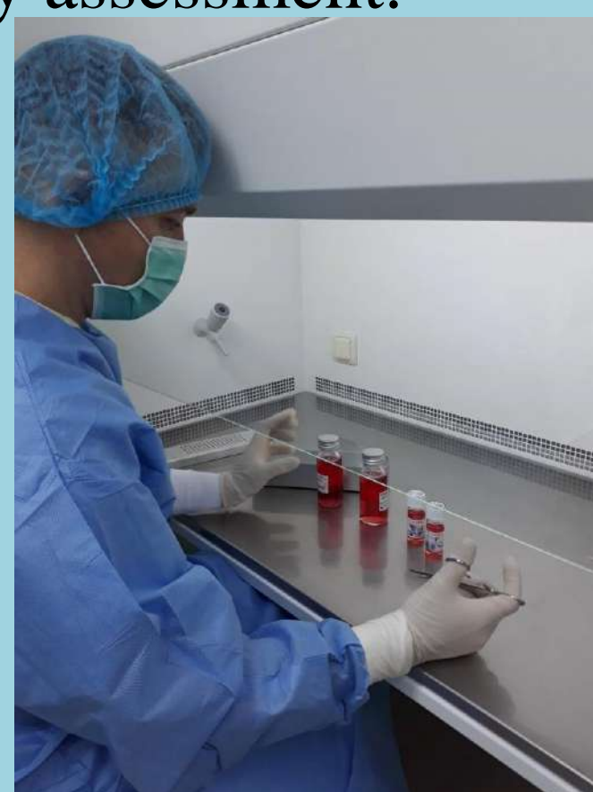
Figure 4. Examination of the corneas in the Human Tissue Bank

Conclusions: 1. The analysis of the Tissue Bank database provides valuable information about corneal transplantation in the Republic of Moldova. 2. The rate of corneal utilization increased during each year of the study, reflecting improvements in all areas of Tissue Bank operation, in particular, corneal storage and decreased microbiological contamination. 3. The Human Tissue and Cell Bank, founded is the main supplier of the corneas graft for the transplantation in the Republic of Moldova.