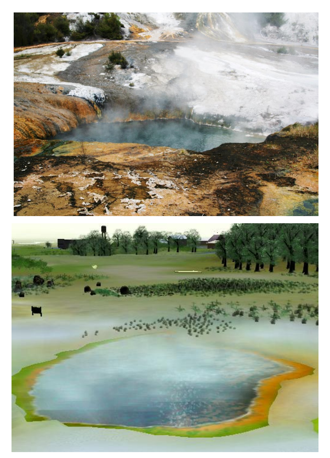
Figure 1: (Top) A photograph of the Hochstetter Pool (foreground) at Orakei Korako which the students were asked to describe in the field. (Bottom) A screenshot of one of the three, fictitious Sapphire Pools which were described by the students in the GeoThermal World videogame.

We discuss here the learning gains (i.e. knowledge acquired) achieved from a virtual field locality (the Sapphire Pools) within the videogame, compared to an actual field locality (the Hochstetter Pool) at Orakei Korako. Images of both settings are included in Figure 1.