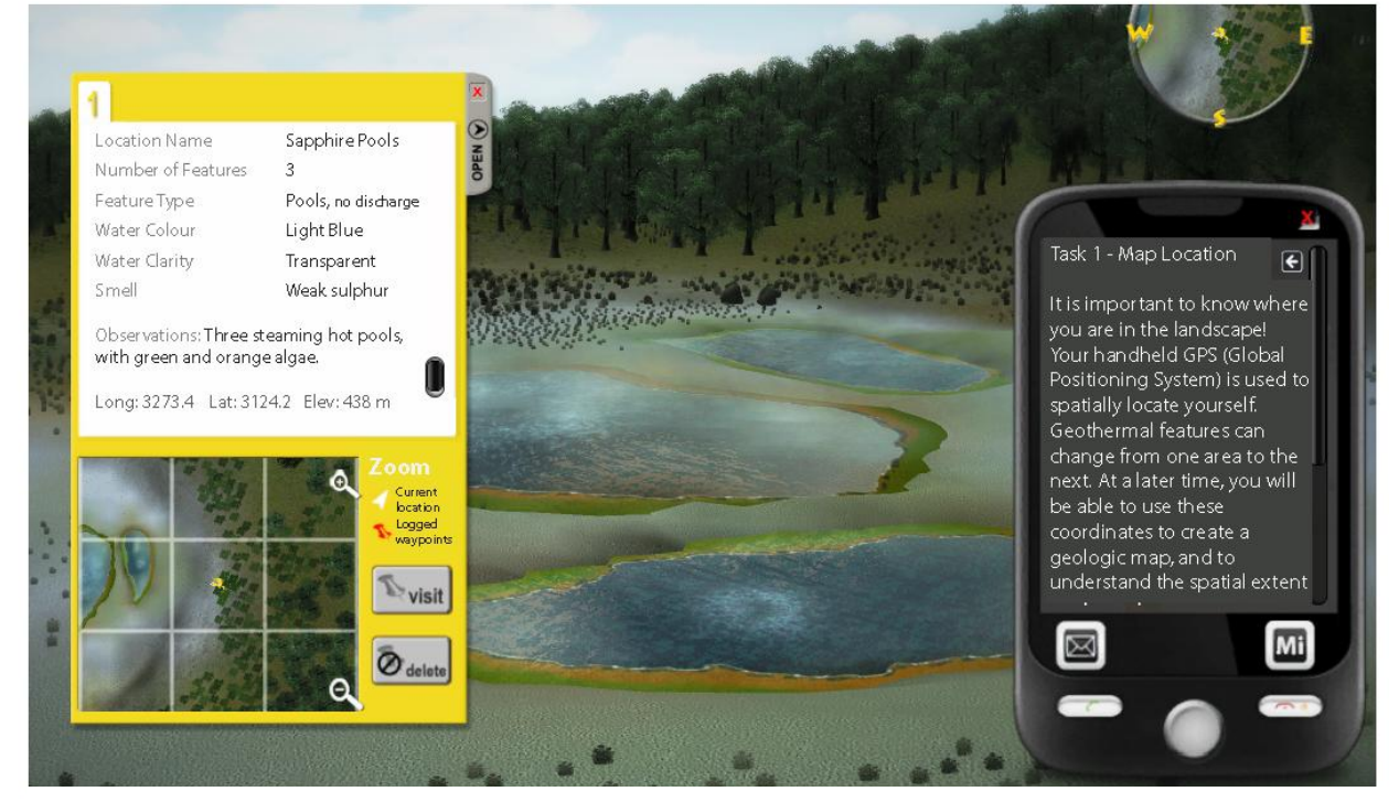
Figure 2: A screenshot of the Sapphire Pools, with two important tools which were developed for the videogame. (Left) A digital geologic notebook which has drop-down options (e.g. Number of features, etc.) and a section for written observations. (Right) The students' Smartphone, which contains hints and contextual information to guide the student through the observations of the hot pools.

The videogame study consisted of many 1-1.5 hour lab-style sessions where 1-6 students played individually and in pairs over several days in June 7<sup>th</sup>, 8<sup>th</sup>, and 12<sup>th</sup> 2012. The computers were set-up adjacent to one another like a typical computer room/lab setting. Video observations were recorded to follow the behaviour, and student language use