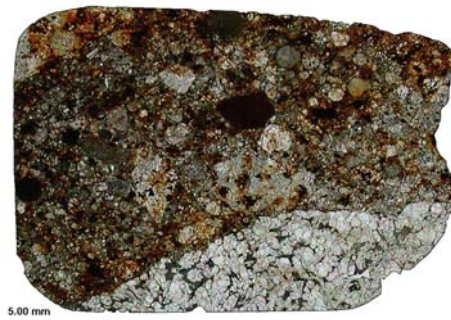
Figure 1. Plane light image of the thin section, shows distinct lithologies of the L3-6 host and the coarse-grained clast (lower right). Note the 5.00 mm scale bar.