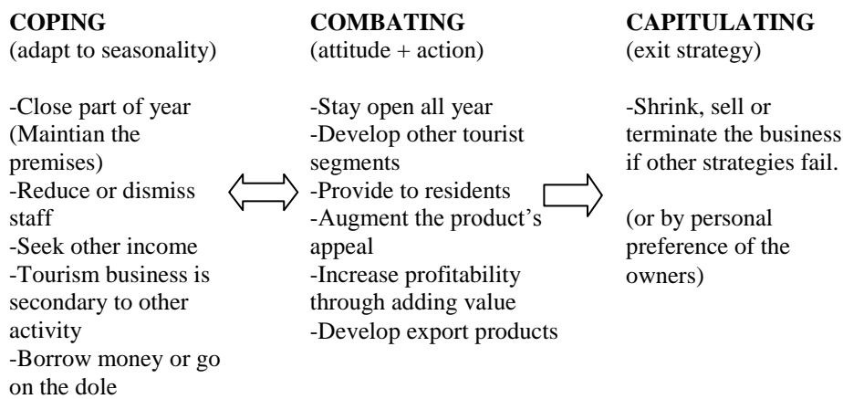
Figure 2: Family business strategies and actions related to extreme seasonality of demand

found five observed types of seasonal opening/closing patterns among family businesses in Bornholm, Denmark: Open all-year; Closed seasonally; Partially open; Strictly supplementary; Double occupation. Amongst these family businesses, the research illustrated a continuum of strategies for “coping” with or “combating” seasonality (see Figure 2).