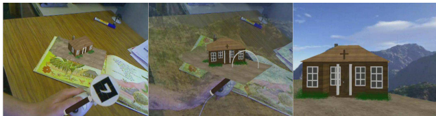
Figure 1: New transitional interface redefined: a continuous perceptual transition between different contexts.

Allowing users to simultaneously interact in multiple types of spaces (AR,VR) and environments at the same time can be beneficial for a large number of applications such as architecture, chemistry, etc. Although it is possible for collaborators to be present in different spaces, moving between these spaces can also be quite advantageous. In the MagicBook project [1], an interface was proposed to allow seamless transitions between different interaction spaces. A lot of other projects have replicated this idea, but none has tried to formally describe or evaluate the concept. Furthermore, many perceptual and awareness factors have been ignored, such as the user's awareness requirements during a transition.