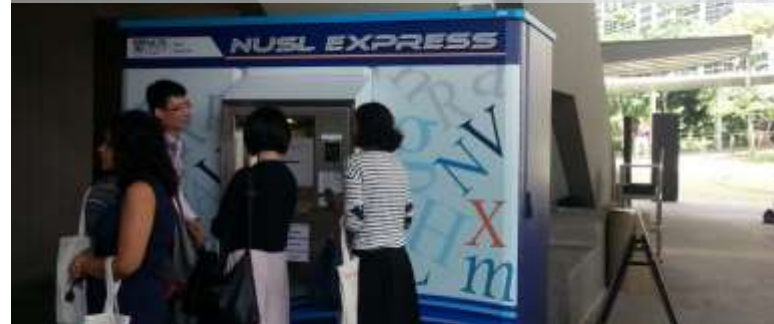
2. Visiting the NUS Hon Sui Sen Memorial Library (Business Library)