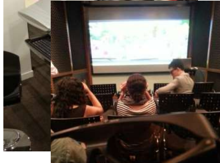
2. Visiting Art, Design & Media Library at NTU : Participants seated in a "Cinema" and trying on 3D-Glasses