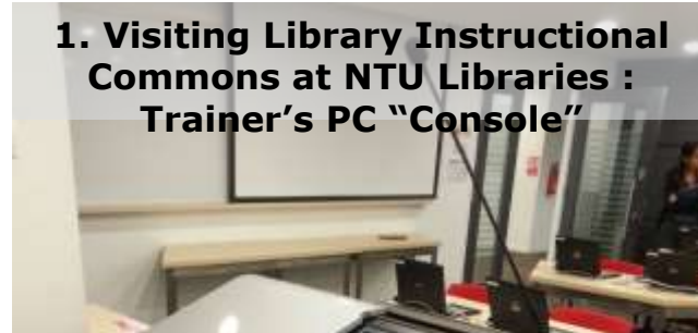
1. Visiting Library Instructional Commons at NTU Libraries : Trainer's PC "Console"