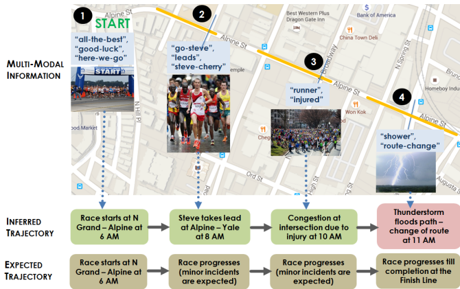
Figure 1. Multimodal social network information for situational understanding—a marathon example.

The rest of the paper is organized as follows. In Section II, we provide an illustrative example of social sensing to offer a context for later discussion. Motivated by this example, in Section III, we present an information processing architecture that addresses the requirements mentioned above. We then discuss its key components and underlying technologies. In Section IV, we highlight research challenges and open avenues for investigation, brought about by this architecture. We present related work in Section V, and conclude the paper in Section VI.