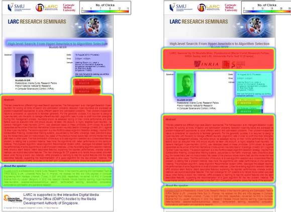
Figure 4: Mouse-clicks Heatmap of Control (Left) and Treatment (Right) groups. In this example, we are experimenting with the effect of an additional authority message (Treatment) highlighting the credentials of a seminar speaker.

can be divided into six main component as shown in Fig. 3, namely (anti-clockwise from the top): (i) a temporal line chart of the selected statistic (mouse clicks, mouse-overs, session duration, new visitors, etc); (ii) aggregated statistic of user activities, sessions, demographics, etc; (iii) world map of visitor location; (iv) heatmap of user activity (examples shown in Fig. 4); (v) dynamic calculation of conversion rate; (vi) histogram of user grouping statistic.