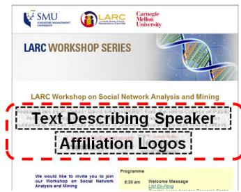
Figure 2: Event page with the authority message (red box)

the workshop title and comprises a textual description of the authority speaker and a logo of the authority speaker’s affiliation. Fig. 2 shows an example of the authority (treatment) message and its placement on the workshop page.