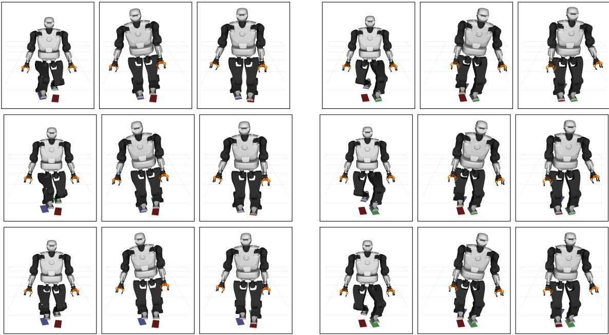
Fig. 2. Examples of predicting single-step motions. Warm-start produced by Top : GPR, Middle : GMR, and Bottom : k -NN. Left : left foot movement. Right : right foot movement. The green, blue and red box correspond to the initial left, the initial right, and the goal contact pose, respectively.

q . We do not predict the trajectory of the control input here, but instead calculate it from q assuming quasi-static movement. This computed control input trajectory is denoted as u_0 . The initial guess is used to warm-start Crocoddyl, and the result is compared against the cold-start. We also compare the effect of using Database Hpp and Crl. We use a large convergence threshold ( 10^{-2} ) for Crocoddyl here, based on the assumption that at online computation a very refined optimal motion is not really necessary. The number of iterations is also limited to 20. The query time is \sim 5 ms for GPR and \sim 10 ms for GMR in python implementation.