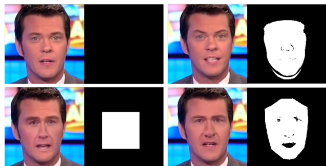
Figure 1. Original video frame (top left), video frame modified using Face2Face method [30] (top right, smooth mask almost completely covers the skin area), using Deepfakes method [1] (bottom left, rectangular mask), and using FaceSwap method [27] (bottom right, polygon-like mask).

A major concern in digital image forensics is the deepfake phenomenon [1], a worrisome example of the societal threat posed by computer-generated spoofing videos. Anyone who shares video clips or pictures of him or herself on the Internet may become a victim of a spoof-video attack. Several available methods can be used to translate head and