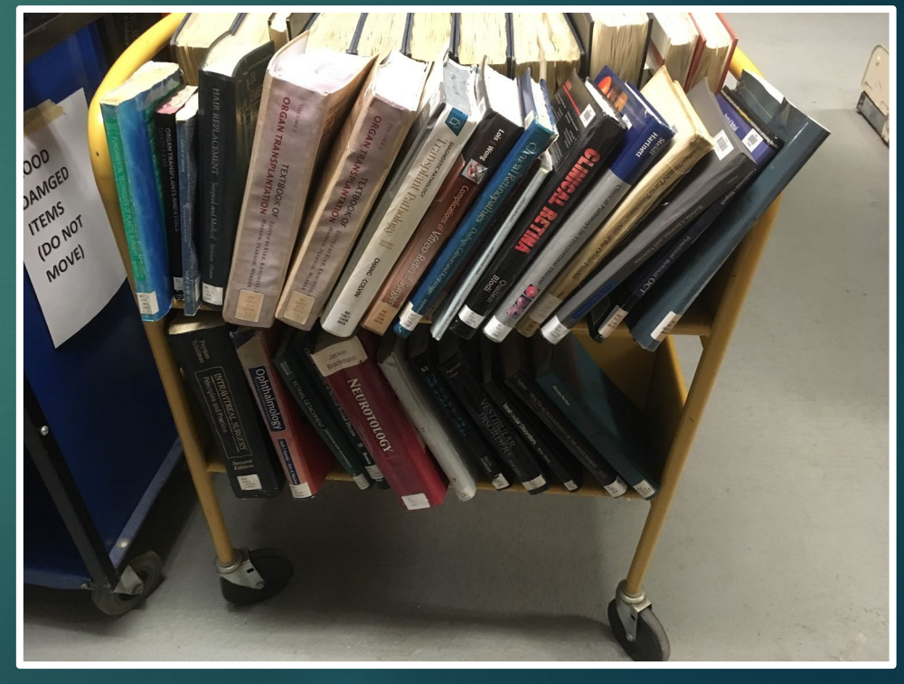
Himmelfarb Library Stacks, Feb. 2019