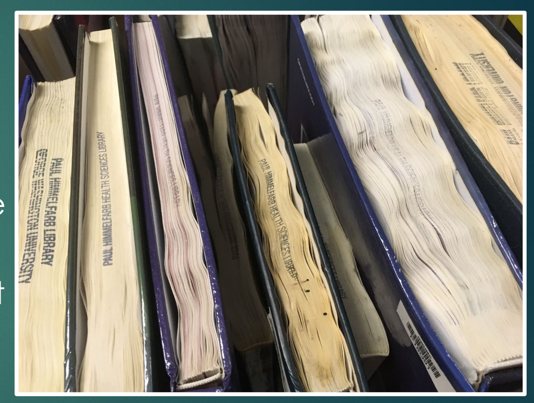
Himmelfarb Library Stacks, Feb. 2019