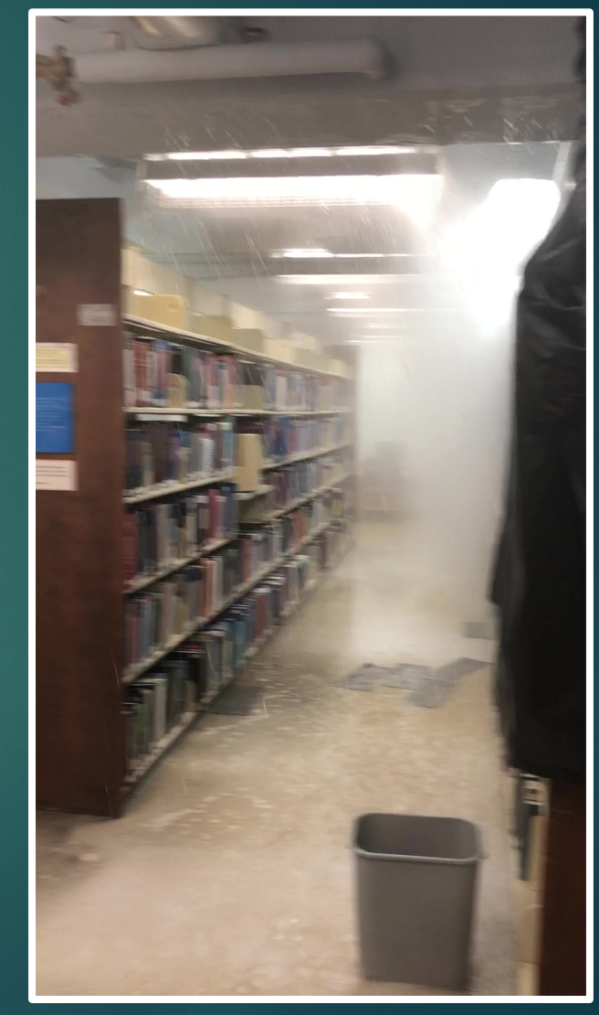
Himmelfarb Library Stacks, Feb. 2019