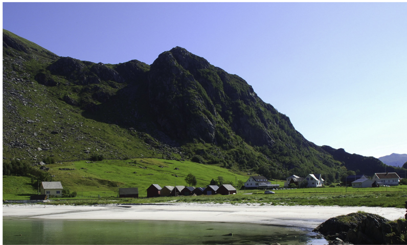
Fig. 3. Coastal landscape with arable land surrounded by outfield pastures at Grotle, Bremanger municipality, western Norway.

with different rates for arable land and enclosed farm pastures, the GS, which is a payment based on the number of grazing animals with different rates for grazing on farmland and rangeland, and the RES which works as a site specific support for local projects dealing with i.a. grazing and landscaping. The forth policy instrument consist in regulating the price level for concentrated feedstuffs to ensure production and use of local resources of roughages and pastures.