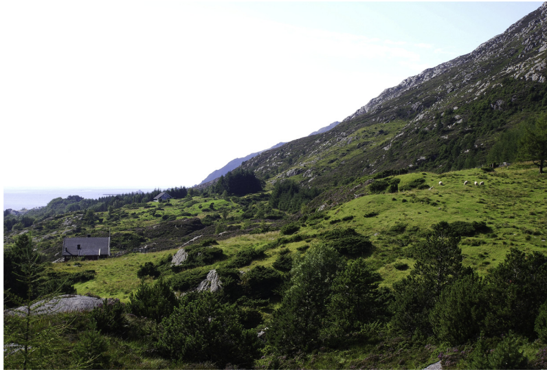
Fig. 2. Landscape encouragement in coastal farm pasture at Grotle, Bremanger municipality, Norway.