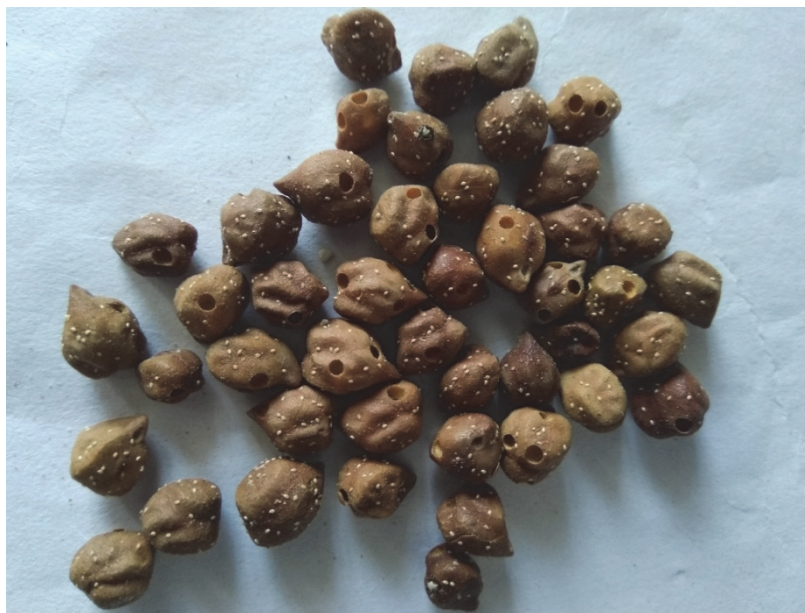
Plate 5. Damaged 1gram seed after 1 month

Where, A= Initial weight, B=Final weight