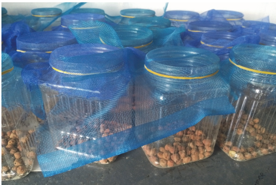
Plate 4. Experimental set up of chickpea seeds with treatments

The powders were mixed up with gram seeds following three different rates (1.5, 1.0, and 0.50 g/kg seeds) in separate petridishes of 90 mm in diameter. Five pairs of newly emerged adult beetles were released into each Petridish containing treated seeds. Three replications were made for each treatment, the control included. Petridishes were kept at the room temperature without any disturbance. The efficacy of powders against pulse beetle was evaluated with due consideration of parental mortality, number of eggs, adult emergence, seed weight loss and germination regarding treated and untreated seeds.