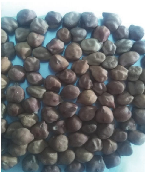
Plate 3. Fresh chickpea seed

Chickpea ( C. arietinum ) seeds were used in this experiment as host of pulse beetle and collected on local market of Mymensingh. The seeds were completely free from insects, microorganisms, food grains and other materials. There were no other crop seeds and foreign materials in the seed lot. Before being stored, seeds were properly dried and kept free of any insecticide treatment.