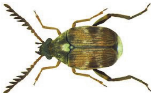
Plate 1. Adult pulse beetle

Pulse beetles were reared by maintaining insects on chickpea seeds under room conditions (27°C, 70% air moisture) in the Laboratory. Fifty (50) pairs of adult male and female pulse beetles were placed in a glass jar containing chickpea seeds. The jar was then covered with black cotton cloth and the beetles were allowed for free mating and oviposition over 7 days in the aforementioned environmental conditions in a dark place. The parent beetles were removed and pulses containing eggs were kept in a jar for further development and getting new adults. Rearing of the insects was continued for the whole experimental period.