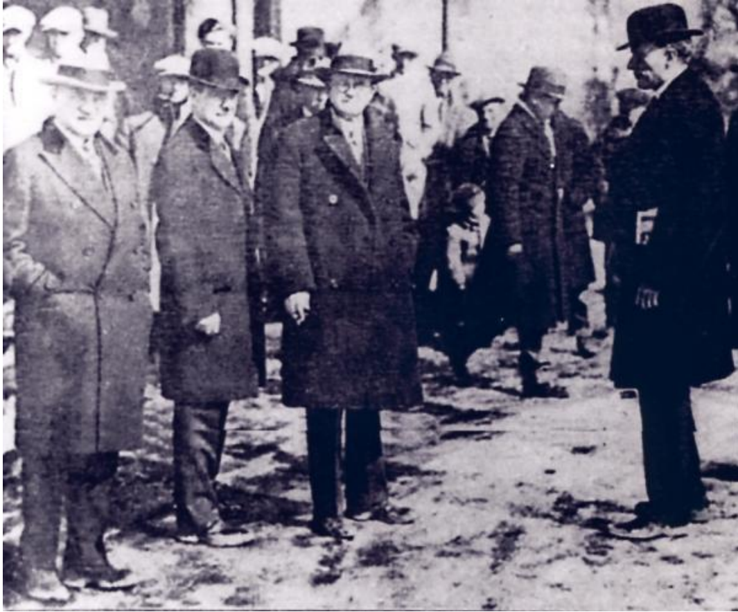
Figure 2: Senators (from L-R) Wagner, Pine, Gooding, and Wheeler, visiting with striking miners in Rossiter, PA, February 1928.

The Senate Committee on Interstate Commerce in 1928 was made up of nineteen white men. After S. Res 105 passed, the committee's chairman, Senator James E. Watson of Indiana, appointed five of them to travel to Pennsylvania, West Virginia, and Ohio and get the lay of the land. When the clock struck midnight on February 22 nd , 1928, this delegation of five United States Senators left their comfortable abodes on Capitol Hill in Washington and motored towards the scandal-ridden coal fields of Western Pennsylvania. 9 The travelling subcommittee included Senators Frank R. Gooding of Idaho, W. B. Pine of Oklahoma, Jesse H. Metcalf of Rhode Island,