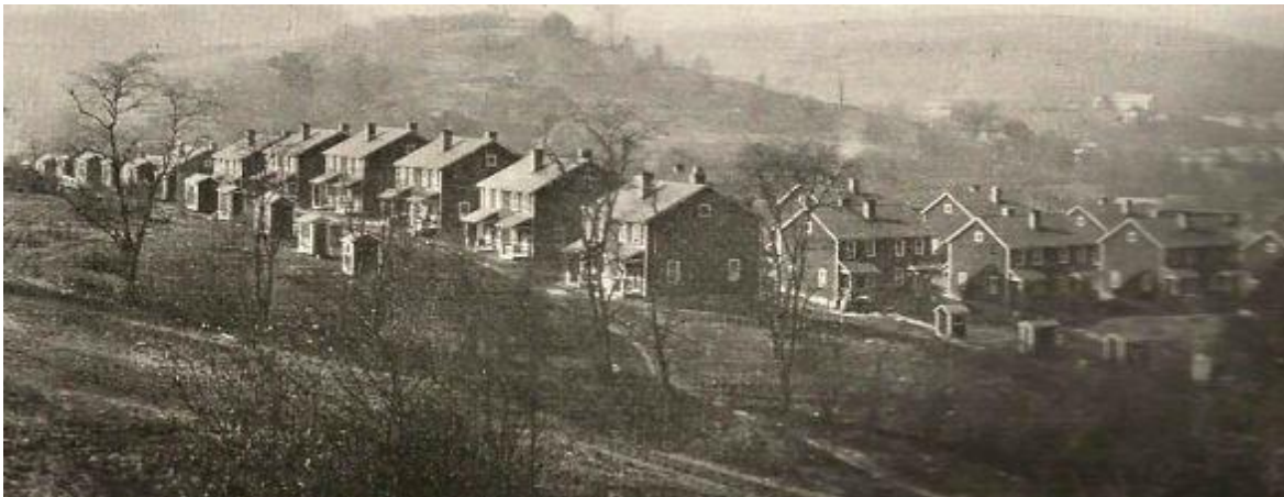
Figure 4: Montour No. 10 mine company town, in Library Township, PA. Circa 1927. From CoalCampUSA.