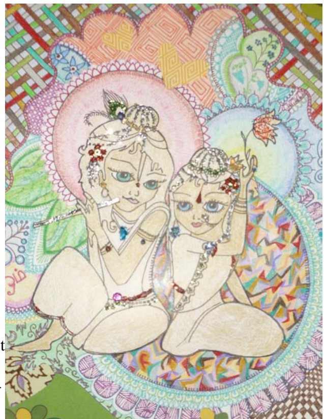
Illustration 1: One of my hand-drawn pictures of Krishna with His female consort, Radha.

During my junior year of college, I lived with a second-generation Taiwanese-American student deeply affected by white privilege and institutionalized racism in the United States. At that time, I had several posters of Krishna from India, as well as some hand-drawn pieces, hanging above my bed. The student and I rarely talked about spirituality, and I was surprised to discover, at the end of the year, that my posters had offended him. He argued that, because I am not Indian, I cannot fully understand an Indian god. He said, “Krishna isn’t Jesus,” implying that I was adhering to Western understandings of God, simply dressed in the Indian form of Krishna. In his opinion, the Krishna posters on my walls were a form of cultural appropriation.