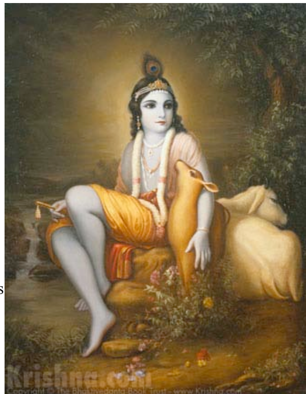
Illustration 2: Young Krishna in Gokula

The young version of Krishna is also famous throughout India and elsewhere for His tendency to steal butter and milk from the gopis , or the cowherd women of Gokula. In His adolescence, He performed amorous pastimes with the young gopis in the forest outside of the village. Krishna was a naughty, playful, but much beloved child, and though we human beings should not imitate many of His behaviors, His relationships in Gokula provide us with examples