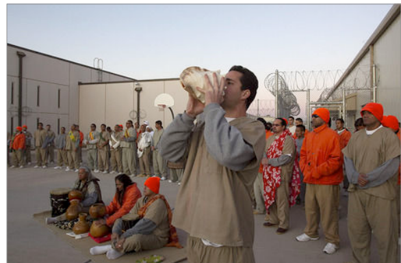
figure d: A Native Hawaiian inmate at Saguaro Correctional Center, in Eloy, Arizona, blows a conch shell to honor the Hawaiian season of Makahiki, a season historically associated with Lono, the god of peace and fertility.