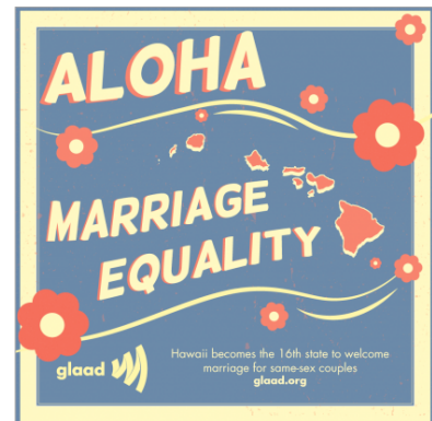
figure c: GLAAD graphic highlighting the “aloha spirit” in passing SB1.

With the statement, GLAAD released a minimalistic graphic reading “Aloha Marriage Equality,” celebrating the passage of marriage equality in Hawai‘i. GLAAD was not the only organization deploying aloha discourse and equality