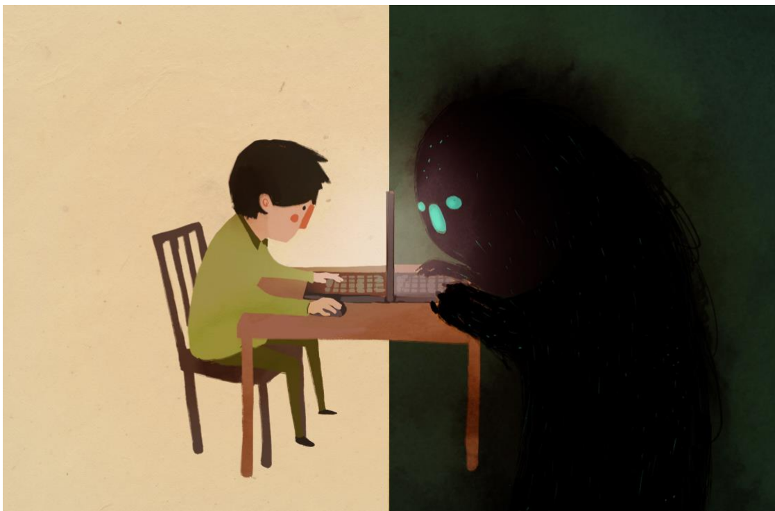
Figure 2: The person to be corrected/redeemed and the terrorist-monster.

other end of the desk, their own laptop connected to the White boy's, suggesting the perils of online communication. An inadvertent visual metaphor for the racialized duality of the person to be corrected (or redeemed) and the monstrous terrorist, the image aptly captures the terms of redemption implicit in Tony's parable and "Recruited by Radicals," which position the Whiteness of their protagonists as vulnerable but savable, and the racialized otherness of their recruiters as predatory, monstrous, and irredeemable.