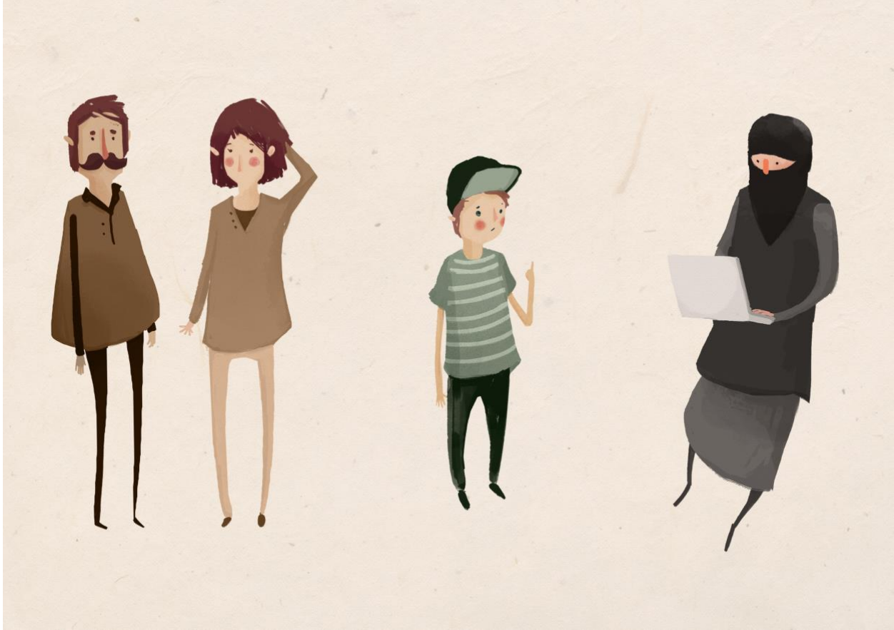
Figure 1: The parable of Tony. From Counterextremism Corrective’s website.

Yet the text below the image extracts a different lesson from the parable of Tony. All of the characters in the story, it declares—the recruiter, Tony, his friends, and even his parents—are terrorists, because all have aided and abetted an organization which practices terrorism, which the same page defines as “an act of violence or the threat of violence against someone or something...[with] the goal [...] to promote a political agenda or a religious belief.”