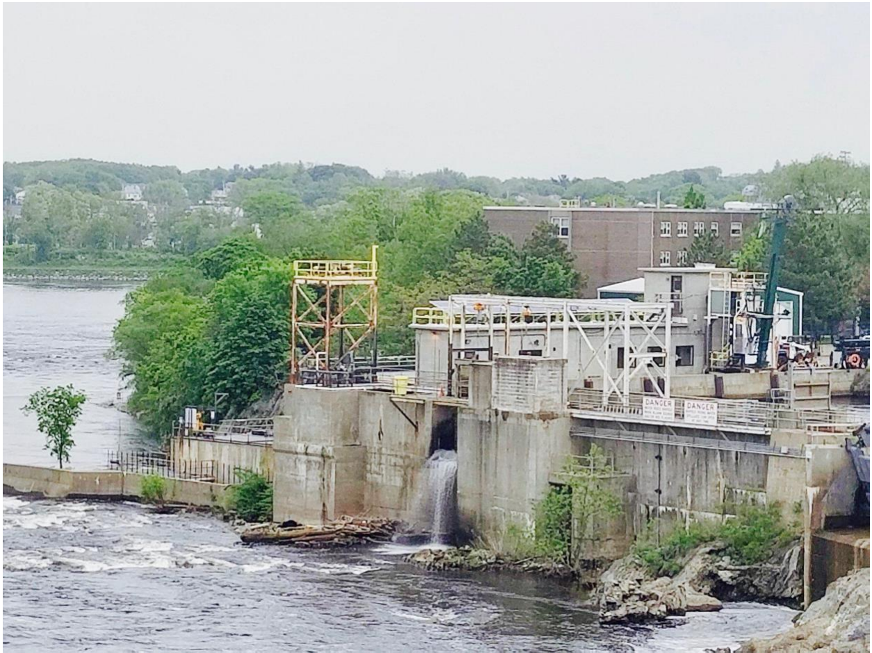
Plate 3: "Today the human race is on the edge of enormous calamity."

Hydroelectric works in Waterbridge, Massachusetts.