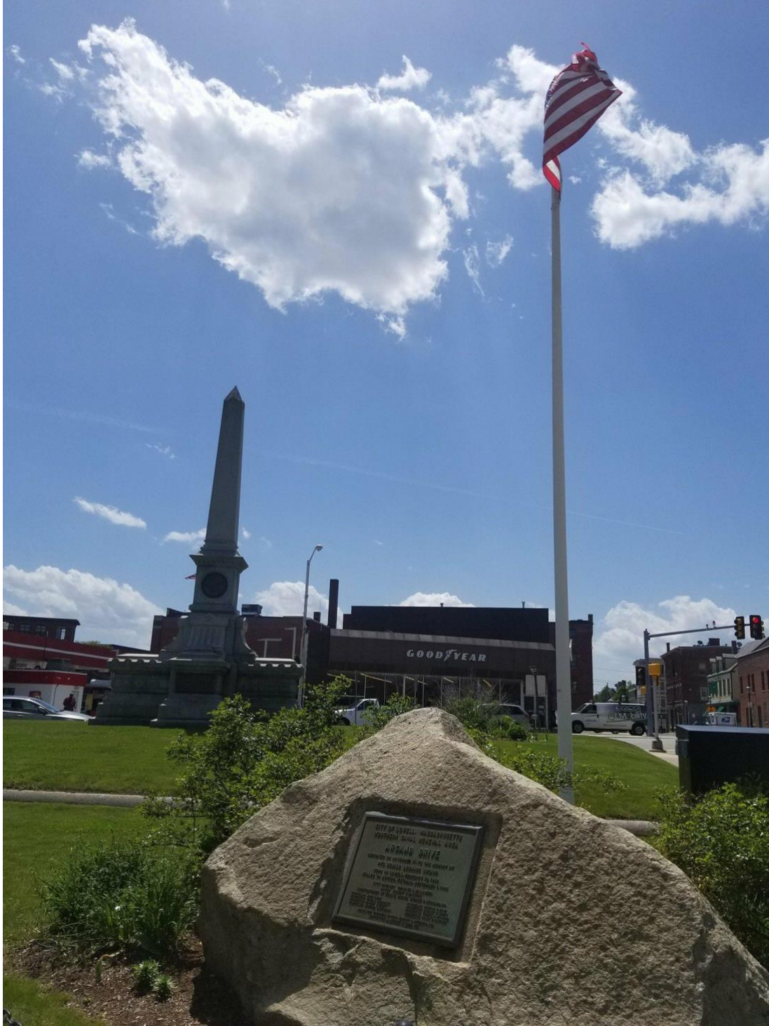
Plate 7: "War is the beginning of salvation."

A New England summer.