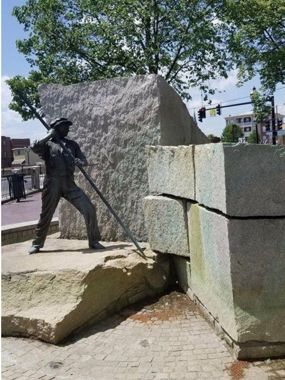
Plate 4: "I do not believe in life after death."

Statue of canal dredger in downtown Waterbridge.