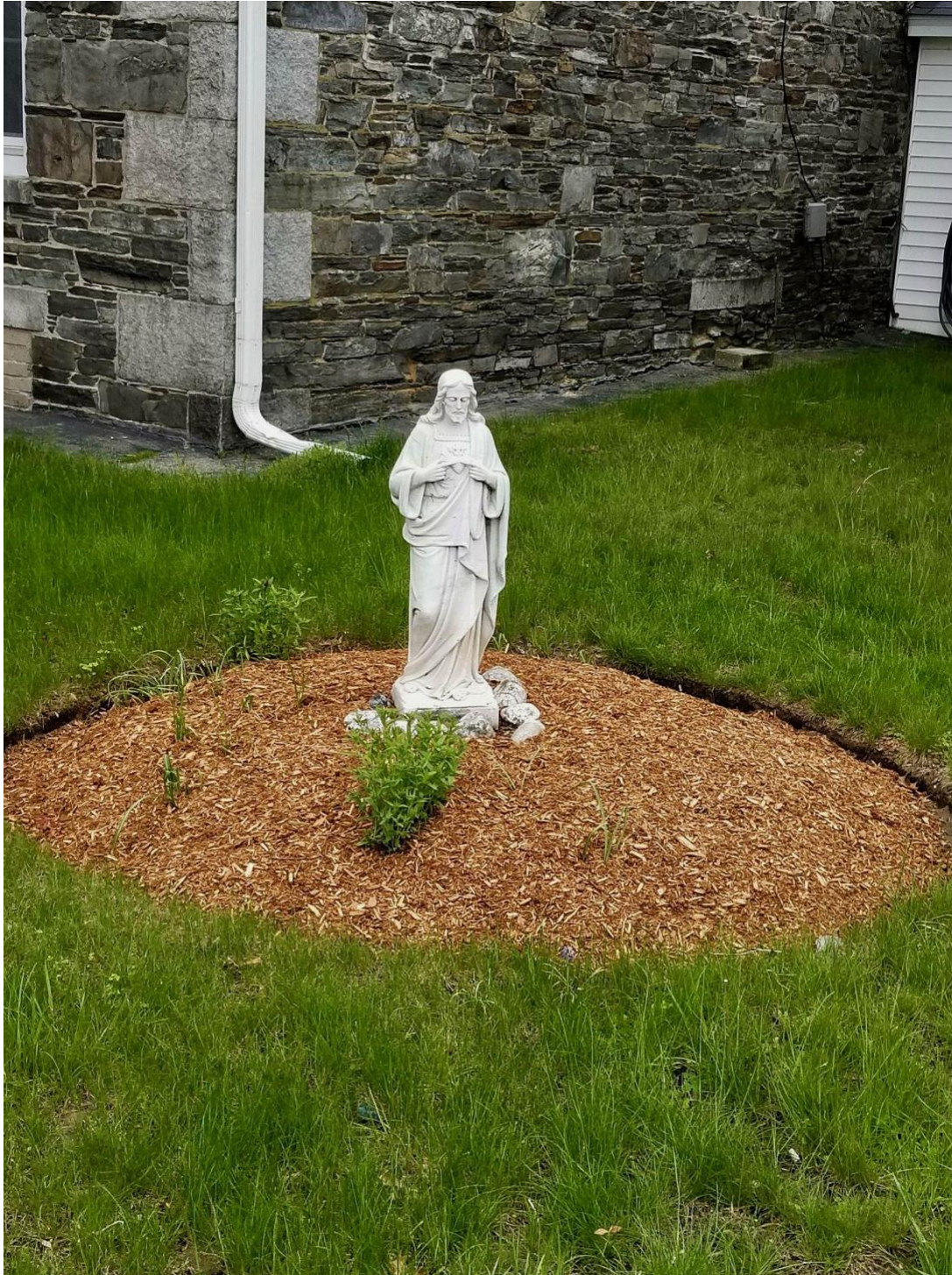
Plate 5: "The present day world is vile and miserable."

Christ the redeemer, in the yard of a funeral home in Waterbridge.