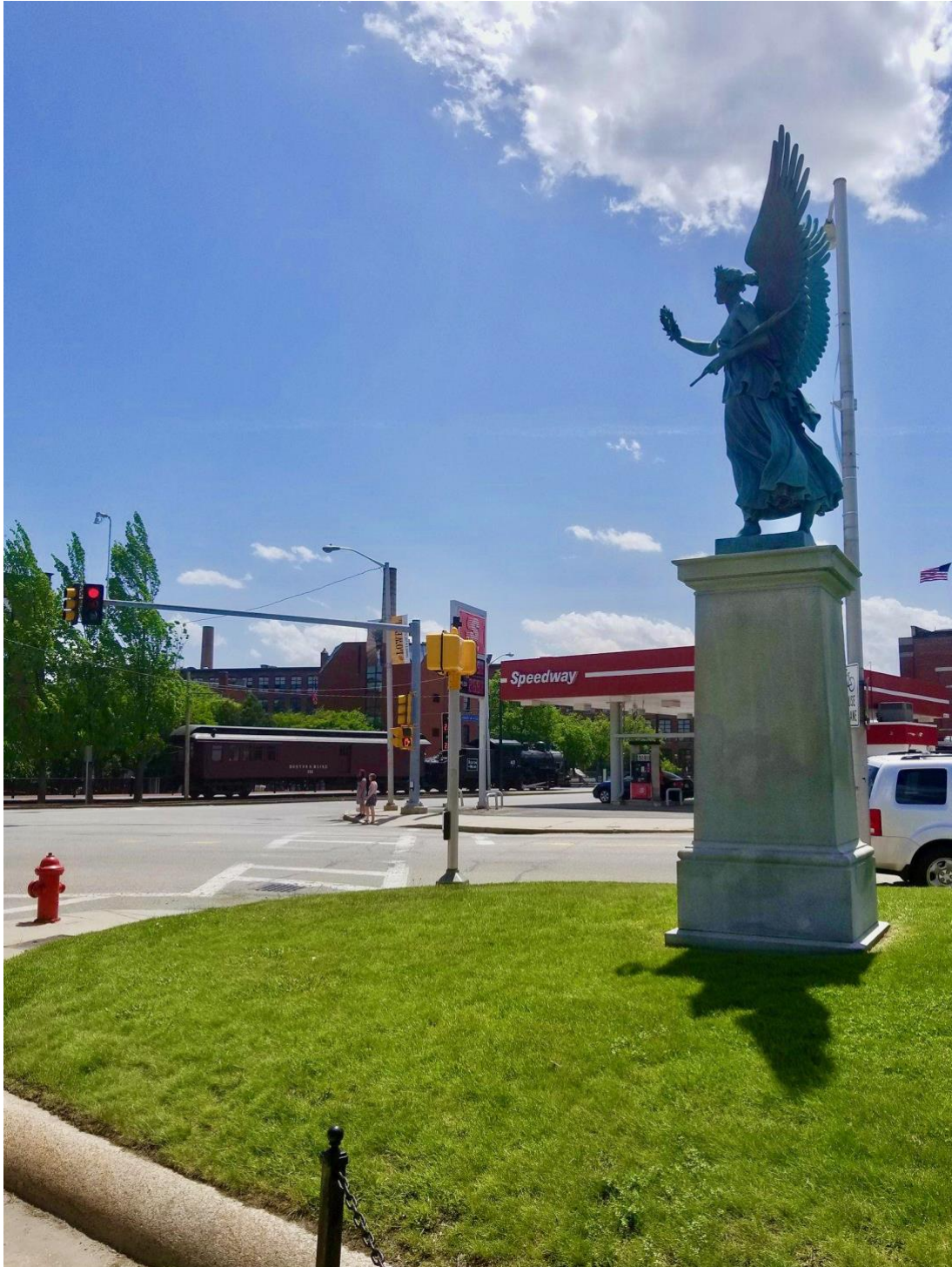
Plate 6: "Our enemy's children are like scorpions."

The Angel of Victory at an intersection in downtown Waterbridge.