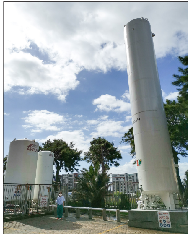
Fig. 3. Oxygen storage tanks at Groote Schuur Hospital.

Caring for this patient was significantly less costly, easier and associated with fewer complications than if she had been admitted to an ICU or ventilated. She was nursed in a six-bed cubicle in an open ward, with minimal extra staff allocated to her care. She was able to feed and prone herself, move her nasal interface, and use a bedpan with minimal assistance. Hospital complications for such an ill patient were minimal because of the use of HFNO – she was awake, developed no bedsores or other complications possible in