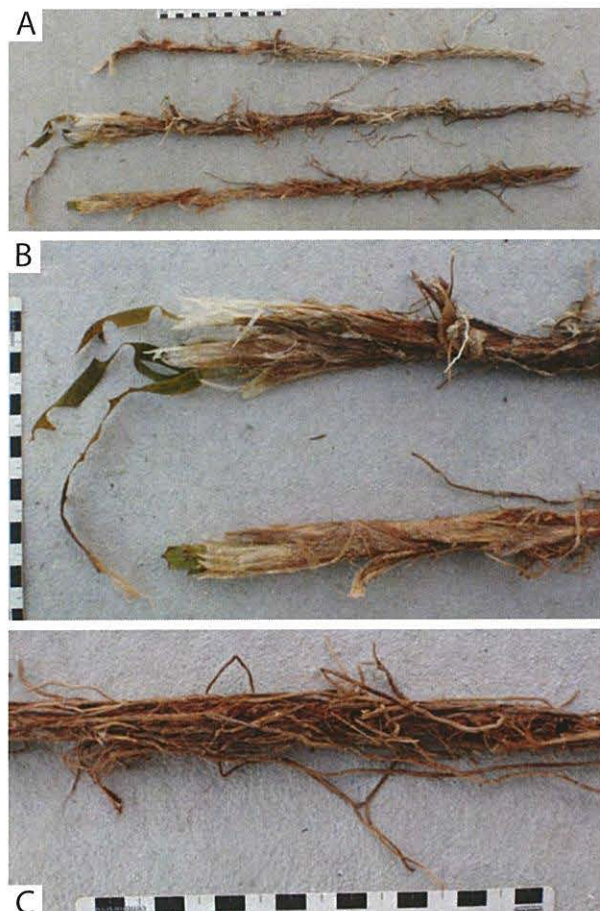
Figure 3. Photographs of recovered specimens of Thalassia testudinum from the study site in Pigeon Creek. Scale in cms. A) Entire specimens. B) Detail of top portions of specimens showing the short seagrass blades with common fish bite marks. C) Close-up photo of robust central cylindrical rhizome and dense network of thin Thalassia roots.

currents have eroded the meadow, producing Thalassia mounds with steep cliffs and breaking apart large blocks of sediment held together by a dense network of Thalassia rhizomes. Pace et al. (1989) also noted that during an intense storm in December of 1986 some of these blocks were torn from the Thalassia mounds and deposited in a surrounding sandy depression in water depth of 1.7 m. Analogous processes of strong tidal current cliff undercutting, aided by occasional strong storm-driven wave currents, is proposed here for the formation of breakdown blocks in the Pigeon