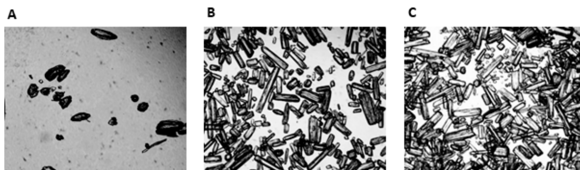
Figure 3. Microscopic illustration (40 \times ) of the LOW (A), MED (B) and HIGH (C) L-Glutamine beverages.

When mixed with fruit squash the LOW, MED and HIGH beverages were visually different, being progressively more turbid as the GLN content increased. The osmolality of the mean GLN dose for the LOW, MED and HIGH beverages were respectively 269 \text{ mOsm}\cdot\text{kg}^{-1} , 281 \text{ mOsm}\cdot\text{kg}^{-1} and 278 \text{ mOsm}\cdot\text{kg}^{-1} . Microscopic evaluation of the LOW, MED and HIGH GLN beverages are shown in Figure 3. The LOW GLN beverage typically revealed less than 20 crystals in any field of view, which had a mean diameter of 0.054 \pm 0.010 \text{ mm} and a mean length of 0.121 \pm 0.044 \text{ mm} , giving them a rounded appearance (Figure 3A). In contrast, the MED beverage had \sim 180 crystals in the field of view, which had a more needle like appearance, with a mean diameter of 0.50 \pm 0.10 \text{ mm} and length of 0.201 \pm 0.074 \text{ mm} with some crystals being up to 0.24 \text{ mm} in length (Figure 3B). The HIGH GLN beverage showed the highest density of crystals with around 290 per field of view, again with a needle like appearance with a mean diameter of 0.046 \pm 0.014 \text{ mm} and lengths of 0.239 \pm 0.036 \text{ mm} with crystals up to 0.27 \text{ mm} in length (Figure 3C). The same pattern regards the number and shape of crystals in the field of view was also present for the LOW, MED and HIGH GLN doses when mixed in either water or fruit squash.