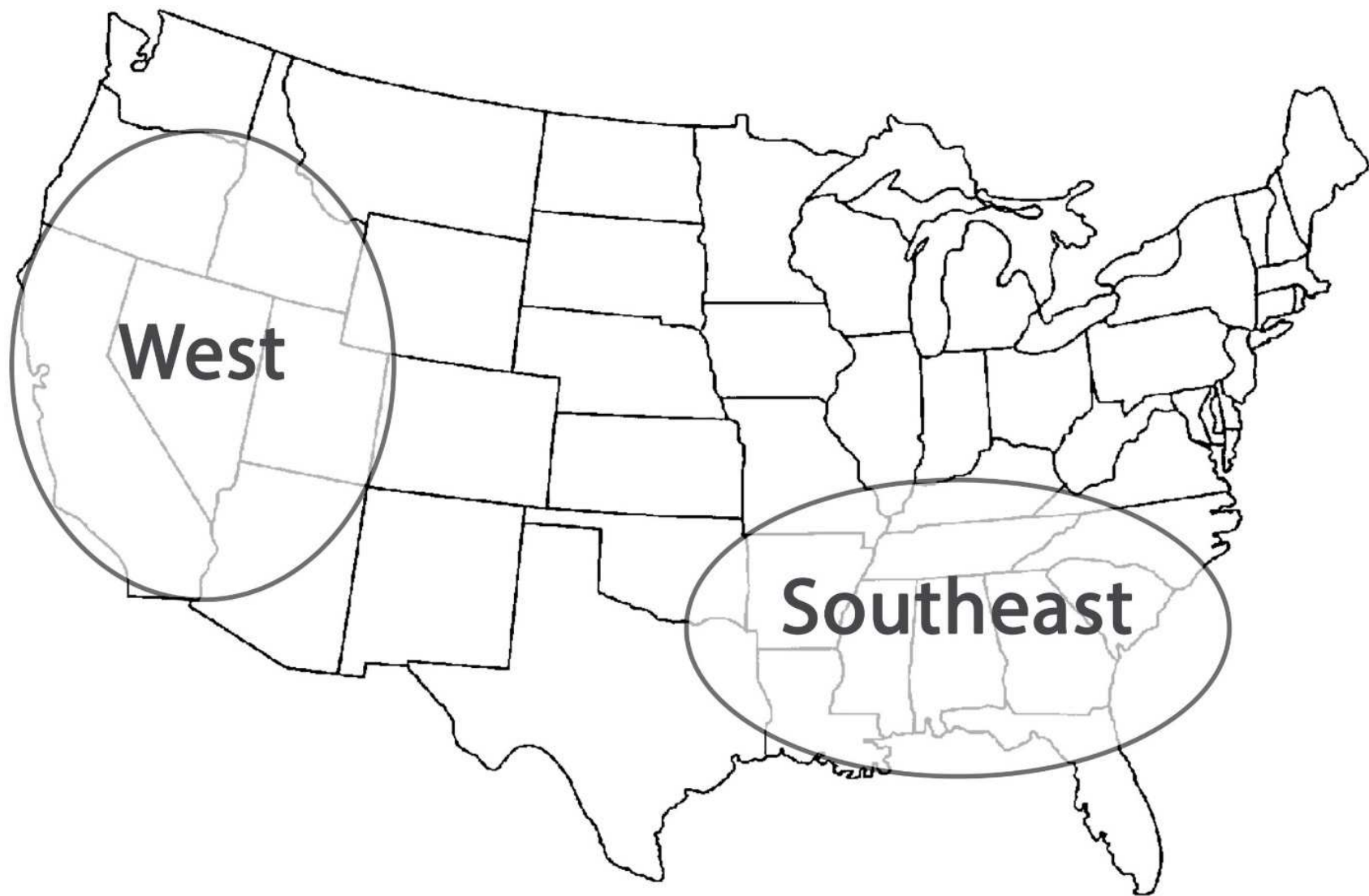
Figure 2.2. Broiler carcass sampling regions.