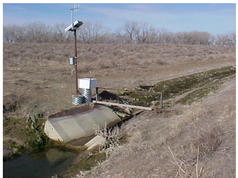
Figure 1. 2005 Photo of the SPDC G2 Flume

CDI units were installed on the SPDC recharge system at the two sites where the CFM units had previously been. Figure 1 shows the installation at the original G2 flume. This site marks the beginning of the reach of the Sandhill ditch for which SPDC receives recharge credit for canal seepage losses. Figure 2 shows the Sandhill pond installation.