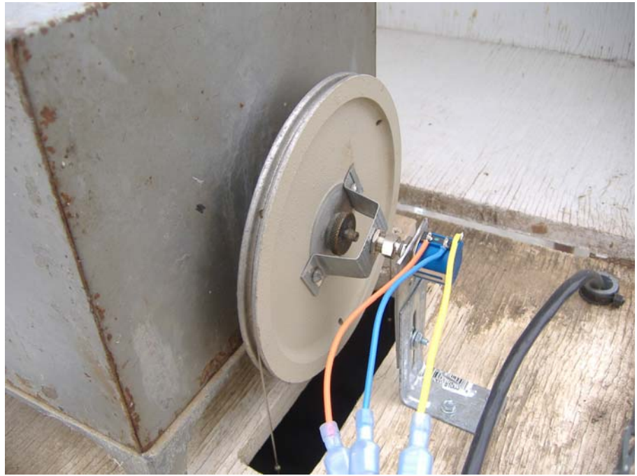
Figure 4. A Potentiometer Mounted to a Stevens type F Recorder Pulley

A potentiometer installed on a Stevens type F recorder is shown in Figure 4. A kit available from Stevens enables a multi-turn potentiometer to be installed in the gear mechanism of the type F recorder. Others who have utilized this kit report that they typically needed to reset the offset on the potentiometer every time a new paper chart is loaded, as it is common practice to loosen the thumb screw that tightens the pulley to the shaft it rotates to adjust the chart to the existing flow level. For this project it was reasoned that by attaching directly to the pulley, the relationship between float elevation and potentiometer rotation would remain constant despite these chart-setting adjustments.