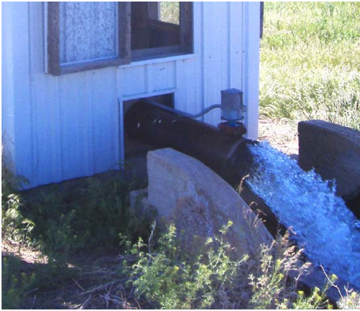
Figure 5. A Pulse Output Module Installed on a McCrometer Meter at a J & E Well

Figure 5 shows a McCrometer meter with pulse output module installed on a well discharge pipe. The pulse output generator is installed at the base of the mechanical meter. Installing this module requires a shaft extension for the mechanical meter as well as longer screws to secure the mechanical meter to the meter base.