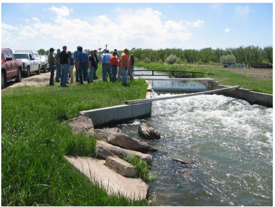
Figure 9. 2008 Field Day Tour Stop at the SPDC Main Flume

SPDC and the participating J&E shareholders have hosted annual field days open to all interested parties in 2008 and 2009. A September date is currently being targeted for a 2010 field day. Figure 9 is a photo of the 2008 field day field tour.