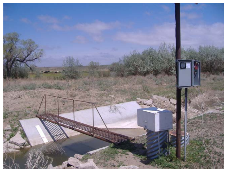
Figure 3. New Ramp-Type Long-Throated Flume at the SPDC G2 Site

calibrations for the "as-fabricated" cross sectional geometry were no longer valid. Additionally, backwater effects on the trapezoidal flume resulted in it operating under excess submergence at flow rates commonly encountered at the site. A new ramp-type long throated flume was constructed at G2 in September of 2007. Figure 3 shows the completed installation at the new G2 flume.