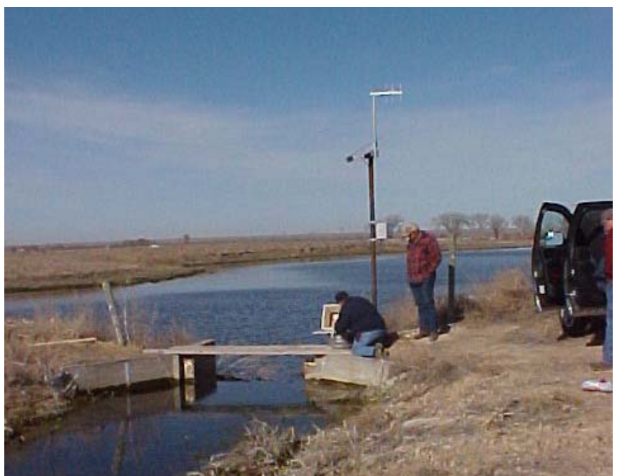
Figure 2. 2005 Installation at the SPDC Sandhill Pond Entrance

During 2005 operations, the CDI equipment provided a promising level of performance with regard to performing on-site functions and in reliably performing data transmission tasks. Performance of third-party level sensors on the other hand was somewhat sporadic. The ultrasonic "down-looker" level sensors that were being used at both sites repeatedly lost accuracy at temperatures approaching freezing.