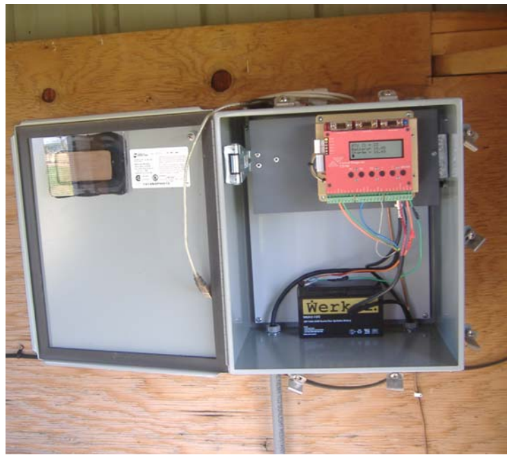
Figure 6. A CDI Radio/Control Unit Installed in the Pump House Shown in Figure 5