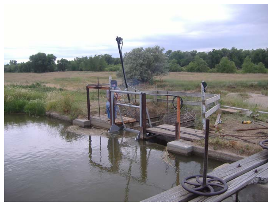
Figure 8. Newly Installed Overshot Gate at the SPDC Spill Structure