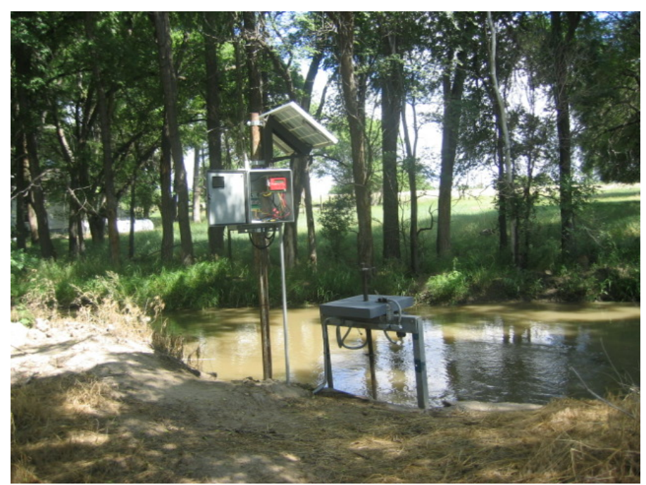
Figure 7. Gate Automation Equipment at SPDC Company Lateral Headgate

SPDC may adjust the gate by multiple means. A new target value may be entered at the District office using a PC linked to the base radio unit. SPDC also has a mobile radio/control unit marketed by CDI as the "Ditch Rider Unit". Following on-screen prompts and providing inputs using the six button keypad, the ditch rider can check current conditions and/or enter a new target value from his pickup. While on-site, a new target may be input following on-screen prompts and using keypad inputs on the field CDI unit at the gate site. On-site toggle switches also allow changing control from auto to manual. In manual an on-off-on toggle is labeled for raise-off-lower positions. And finally, should there be a power or motor failure, by removing a safety guard over the gate wheel and disconnecting the roller chain, the site may be reverted to hand operation in minutes.