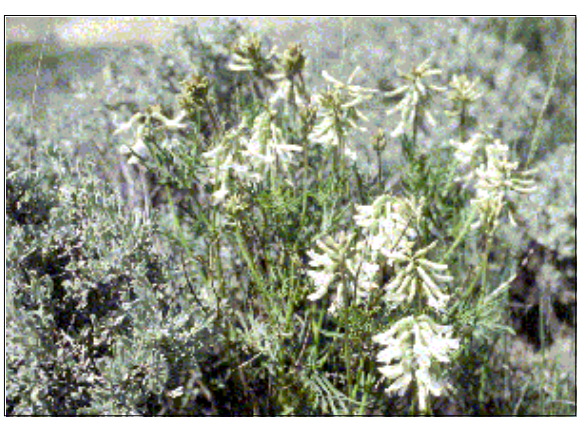
Kremmling milkvetch © S.Spackman, CNHP. 1999.