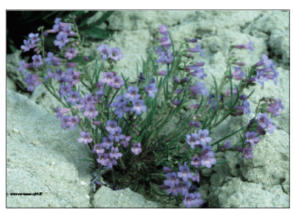
Penland penstemon © B.Jennings , CNHP . 1999.