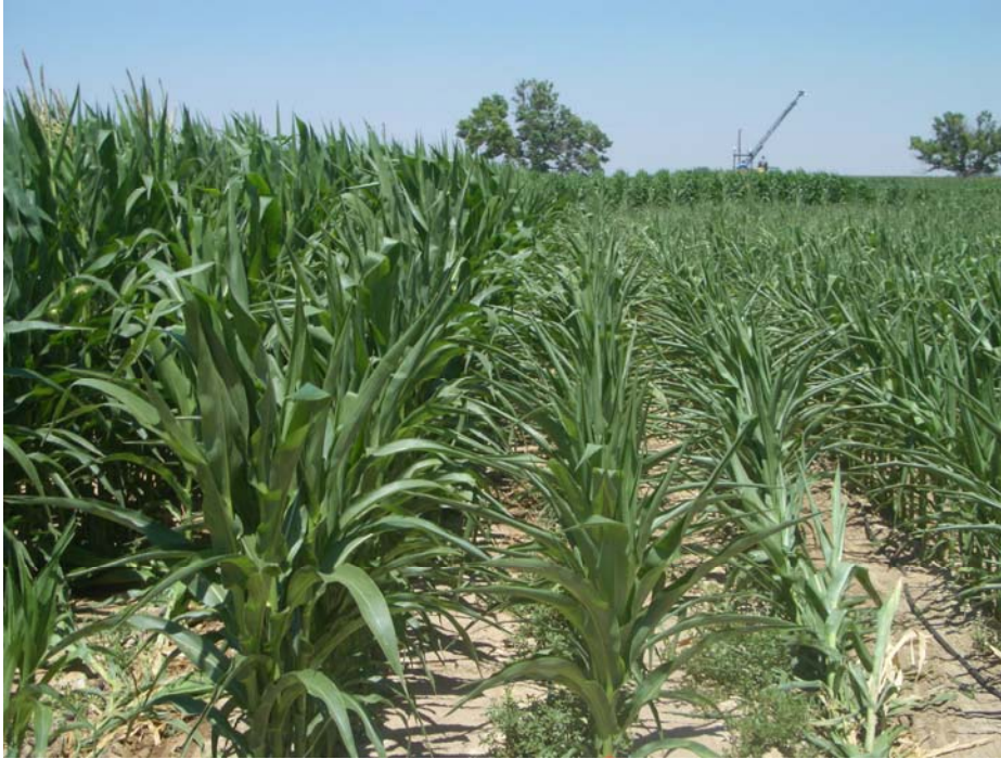
Figure 2. Comparison of corn growth condition on July 31, 2008 just before tasseling. Rows at the left and background are fully irrigated; rows at right are the lowest irrigation level.

However, the water production function for grain yield based on ET is relatively linear. This implies that the corn is equally efficient in its use of every additional unit of water consumed and the marginal value of the consumptively used water is fairly constant over the wide range of applications – about 3 \text{ kg/m}^3 (150 bu/ac-ft).