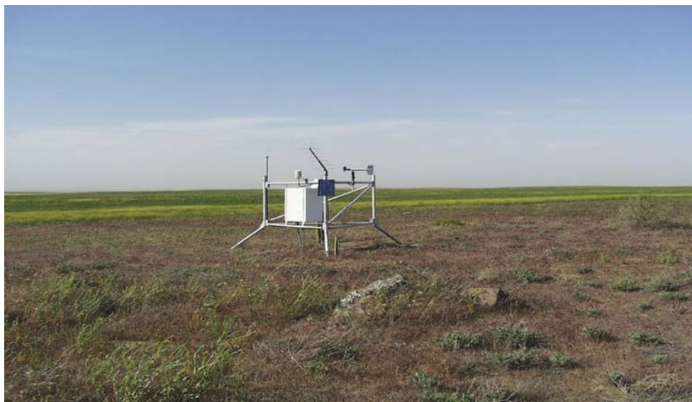
Figure 3. "HERO" AgriMet station located North boundary of BTF.

field, including other analysis, is done at this stage of the ASIM program and a soil moisture report is created.