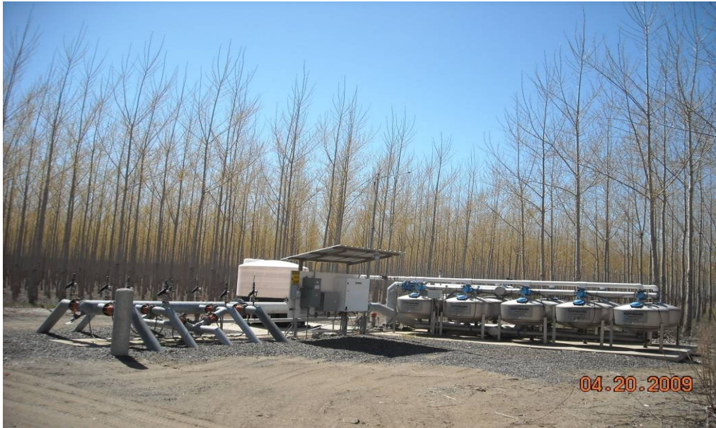
Figure 2. BTF I-SCADA Remote Terminal Unit (RTU) with sand media secondary filters.