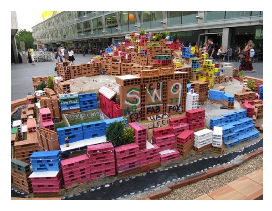
Figure 3: Close-up of portion of Project Morrinho installation at Southbank Centre in London. This section was built by youths from Stockwell and Brixton and features elements of London's poorer immigrant districts whose presence is generally unseen in the cultural center of the English capital.

Festival Brazil transmitted mixed messages about politics of space and the representation of urban identity. In one sense, it communicates a sense that a slum somewhere is equivalent to a slum anywhere, that spaces of certain forms of poverty and violence may differ but share common characteristics that form the basis for translocal cultural exchange. In the awkward yet productive exchanges between Morrinho and Stockwell youth, I could discern an attempt to foster Black Atlantic encounters out of a soft kind of environmental determinism that insisted on the "slum" as a unmarked (yet marking) category. In another register, simultanously, the exhibition places the favela alongside samba, Gilberto Gil, and capoeira without specifying how they interrelate under the rubric of Brazilian cultural heritage, except as an affective repertoire. Another sign cites neo-noir detective novelist Patrícia Melo: "Brazil is astonishment, chaos and progress." The sign added further weight to the widely held assumption that the spectacle of