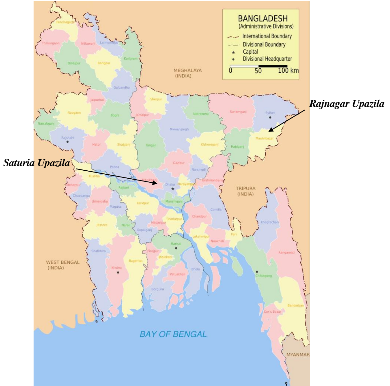
Figure 2: Rajnagar and Satoria