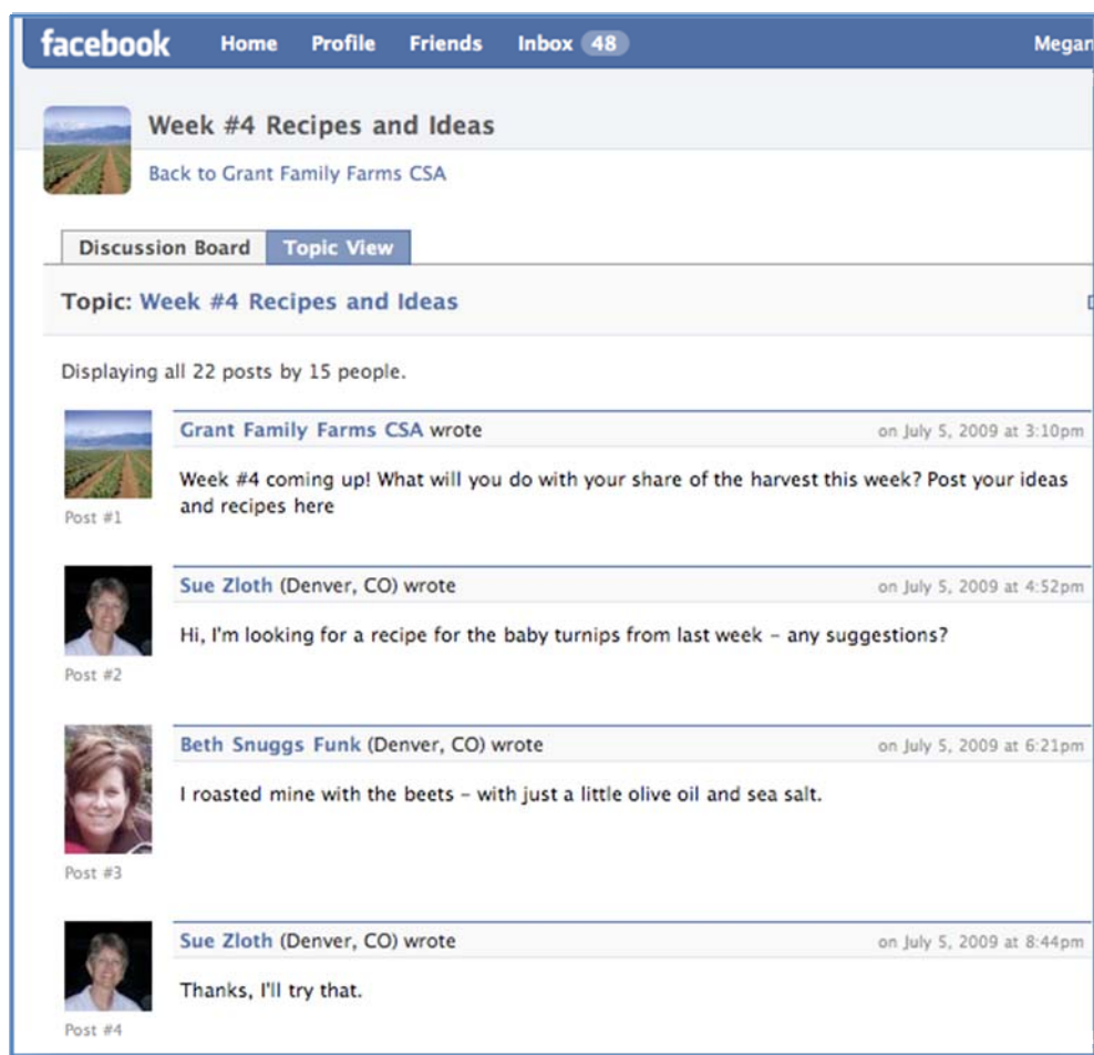
Figure 6: Screenshot from Grant Family Farm’s Discussion Board