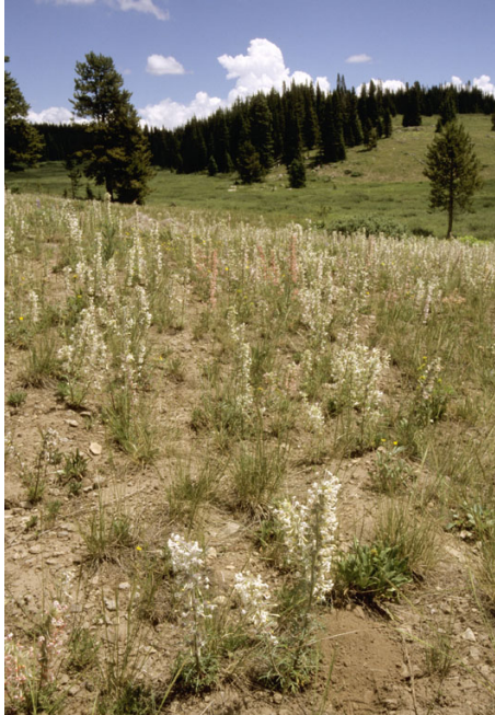
Habitat of Ipomopsis aggregata ssp. weberi