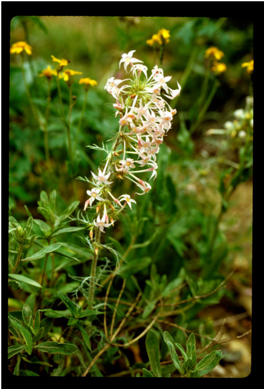
Close up of Ipomopsis aggregata ssp. weberi