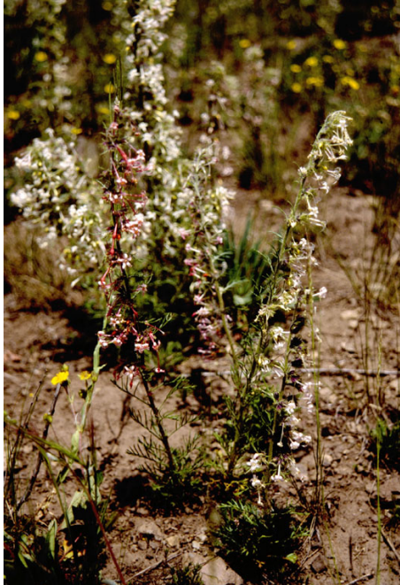
Close up of Ipomopsis aggregata ssp. weberi