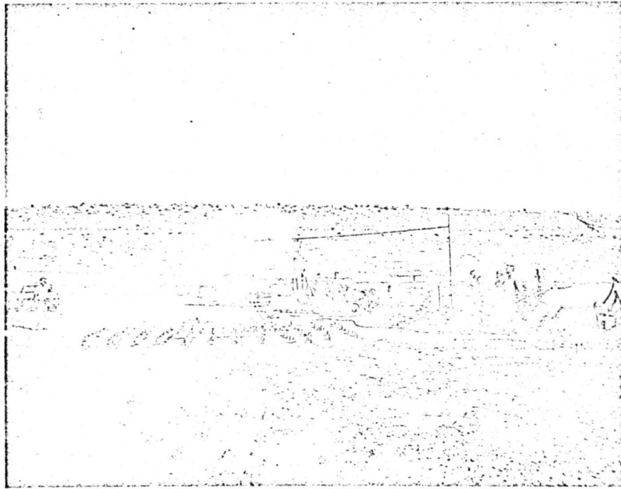
Fig. 1 Preliminary testing of the distribution pattern of rainfall from a nozzle directed horizontally