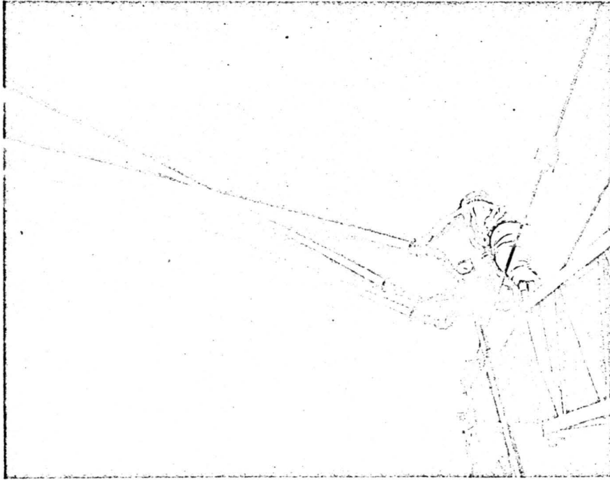
Fig. 3 Adjusting the directions of discharge for the nozzles on the tower of Fig. 2