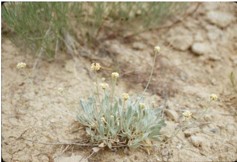
Close up of Eriogonum brandegeei by Susan Spackman Panjabi