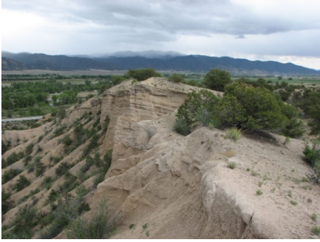
Habitat of Eriogonum brandegeei by Michelle DePrenger-Levin

Occurrences of Eriogonum brandegeei are limited mostly to outcrops of the Dry Union Formation (in Chaffee County) and lower members of the Morrison Formation (in Fremont County), or to Quaternary strata that are derived from these formations (O'Kane 1988, Spackman et al. 1997, Anderson 2006). The unifying feature of all the known occurrences is the presence of a significant fraction of bentonite clay in the soil (Anderson 2006). Bentonite is derived from the decomposition of volcanic ash, and is a type of shrink-swell, or 2:1 clay. Eriogonum brandegeei is most commonly found on active slopes that can be as steep as 90 percent. It has also been documented on flat sites, particularly where erosion has deposited clay soil in small basins (Anderson 2006). In general, this species is found on barren outcrops of white to grayish soils within open sagebrush and pinyon-juniper communities. Frequently associated species include: Atriplex canescens , Opuntia imbricata , Bouteloua gracilis , Oryzopsis hymenoides , Aristida fendleriana , Sphaeralcea coccinea , Cleome serrulata , Melilotus alba , Salsola iberica , Kochia iranica , Melilotus officinale , and Bouteloua curtipendula (Johnston et al. 1981).