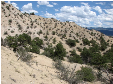
Habitat of Eriogonum brandegeei