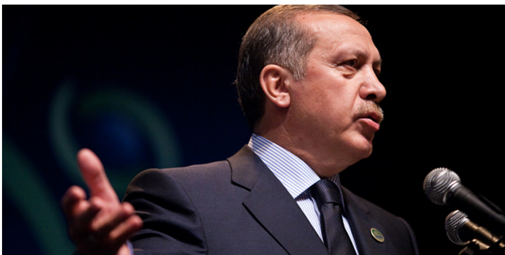
Recep Tayyip Erdogan's (pictured) party did not manage to secure the majority of seats.

The elections on Sunday June 7 were the most important general elections in recent Turkish political history. With a huge turnout, more women in parliament, better Kurdish political representation and a clear 'no' to a presidential system, the future of Turkish democracy looks promising. However, a hung parliament and potential early elections might jeopardise this. Regrettably, the AK Party's initial interpretation of the elections, particularly regarding the HDP's success, is an unfortunate start.