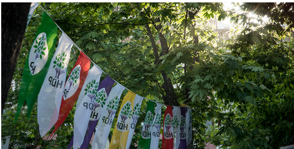
HDP flags

Contrasting with this arrogant and polarising attitude, the co-leader of the HDP, Selahattin Demirtas has adopted a consensual style and his pluralist, democratic, and egalitarian rhetoric found him many friendly ears among the Turkish society. The ongoing peace talks and the halt of the military conflict also have given some level of legitimacy to the party and facilitated the shift in votes towards the HDP. For example, AK Party supporters in eastern and southeastern Turkey shifted their support to the HDP. Similarly, the MHP's vote share increased from 13% to 16% across Turkey, mainly as a response to the Kurdish peace process. All these reasons contributed to the AK Party's loss of the majority.