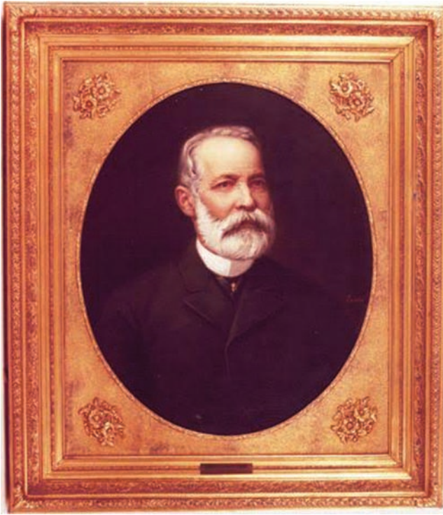
Figure 1. Portrait of Francisco de Oliveira Chamiço, founder and governor of the Banco Nacional Ultramarino.

of the Portuguese government. More those of a colonial company than of a commercial bank, the BNU's operations already merged finance with productivity. The bank furnished vital services and infrastructures, in addition to providing loans to the ailing landed estates in São Tomé and Príncipe (Nunes et al. 2010, 7). Accusations of embezzlement in the BNU's own ranks and a Portuguese banking panic aggravated its predicament. Most significantly, one year prior to Chamiço's letter, a slave-led revolt resulted in the hasty, if long-promised, abolition of an increasingly indefensible labor system, thus threatening Portugal's plans to revive its island territories with capital injections (Clarence-Smith 2000; Eyzaguirre 1986, 181–82).