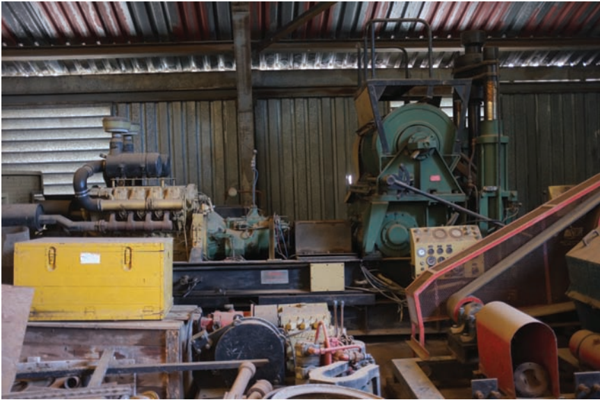
Figure 3. Hellinger's drilling equipment, which is being stored in a warehouse in São Tomé.

As an observation of potentiality, speculation offers a mode of participation in the opportunities that obscured matter portends. It goes along with a distinctive temporal disposition that creatively contemplates possibilities, while excluding others, temporarily suspending a need for certitude in the desire for disproportionate gain. In STP, speculation about future resources generated fresh alliances between public and private actors. From Chamiço's proposal to salvage an ailing colonial territory to the wildcatter Hellinger's ambitious venture, which appealed to cash-strapped officials unversed in either petroleum geology or global markets, different expectations readily converged on an idea of oil and its enabling capacities, both collective and individual. In the face of mounting debt, oil has promised to give a recognizable, sovereign shape to a weak postcolonial state struggling to fulfill its functions. However, the developmentalist vision of oil offers only a deceptive alternative to other, increasingly prominent types of speculative planning, such as the financial speculations of public deficits that have restructured state-society relations in India (Bear 2011). Oil provides a powerful but risky form of economic integration, marred by the disjunctive temporalities of state, science, geology, and markets. It ties collective hopes to the "ethics of probability" of corporate actors (Appadurai 2013, 295), whose capacity to tolerate market