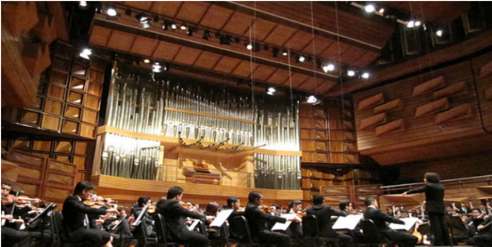
El Sistema and Gustavo Dudamel in concert in Center for Social Action Through Music, Caracas, Venezuela.

Sistema are also internalising values of obedience, hierarchy and competitiveness. This occurs through a system where the standard pedagogic experience involves being shouted at (or even hit) by a young, untrained, poorly paid teacher (there are fifteen index entries in the book for 'verbal abuse and humiliation'). An orchestra may symbolise social interaction without enacting it; democracy is not harmonious, but 'diverse and discordant'. Despite this, the 'web of metaphors' around the ideal of the orchestra is so powerful that we fail to ask critical questions because we are intoxicated by Mahler.