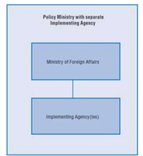
Model 3. A ministry has overall responsibility for policy and a separate executing agency is responsible for implementation.

Development Co-operation Department/ Agency within Ministry of Foreign Affairs Ministry of Foreign Affairs Trade Foreign Development