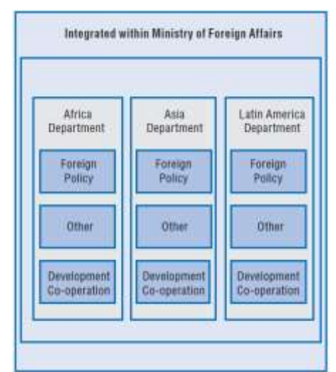
Model 1. The ministry of foreign affairs takes the lead and is responsible for policy and implementation