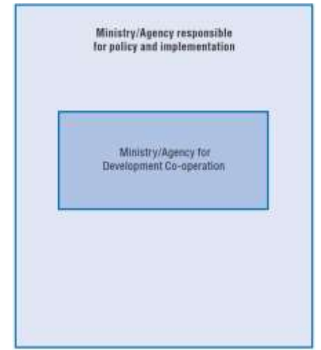
Model 4. A ministry or agency, other than the ministry of foreign affairs, is responsible for both policy and implementation