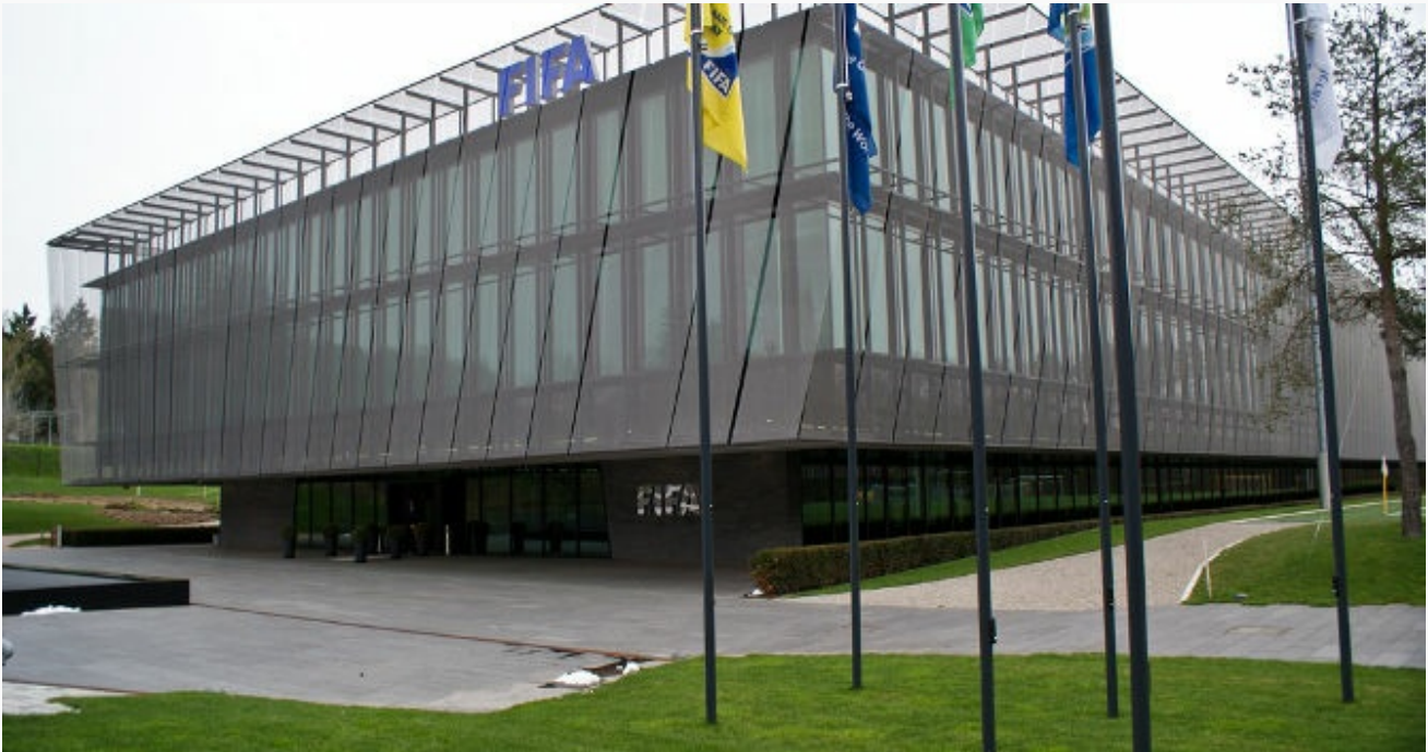
FIFA Headquarters, Zurich.

First and foremost, the resources available to US enforcement officials are far more substantial than