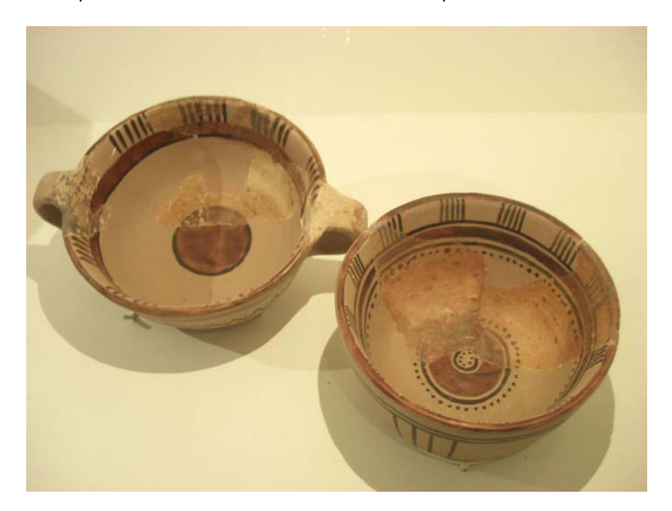
Fig 7. Painted QPW bowls from the shrine of Hathor (Timna Site 200), Eretz Israel Museum, Tel Aviv.