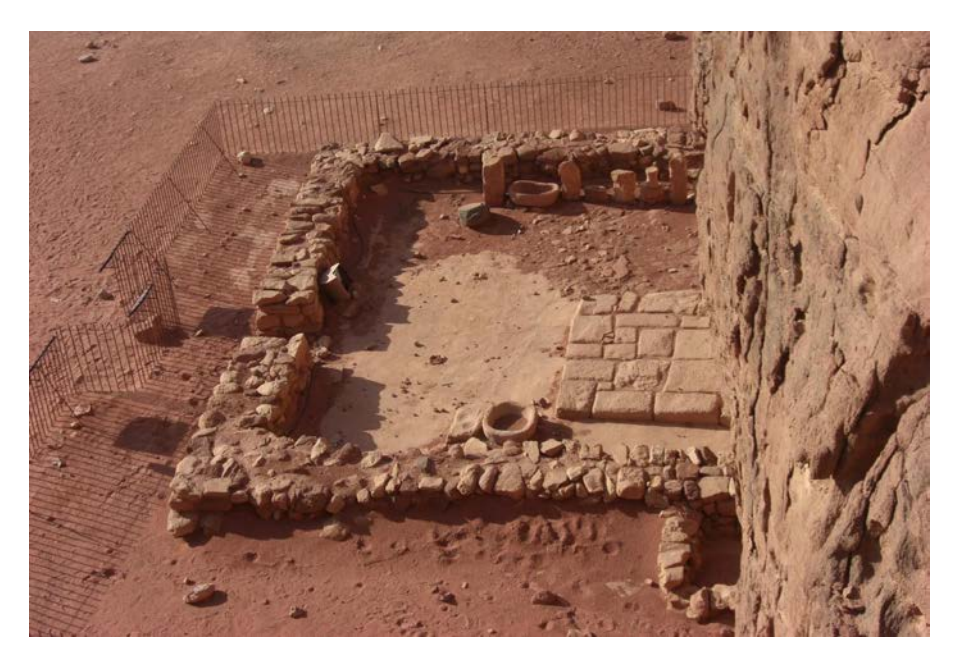
Fig 8. View of the shrine of Hathor at Timna Site 200. Notice the standing stones and stone basins in the two sides.

A small shrine dedicated to Hathor was excavated at Timna Site 200, consisting of an open, squarish court built against the face of rock cliffs, with a large niche cut into the cliff (Fig. 8). More than ten thousand votive offerings were found within and close to the shrine, such as amulets, adornments, figurines and pottery. Rothenberg divided the shrine into three phases. The two earliest were described as predominantly Egyptian; the last one was depicted as a "Midianite" shrine, when the structure was reorganized and many of its architectural parts reused for different purposes (Rothenberg, 1988; 1999: 168-172). Although dedicated to an Egyptian goddess, the shrine's design, small size, and construction materials remind of the open-air sanctuaries popular in the cultic architecture of the desert peoples of the Negev and Sinai (Avner, 2014).