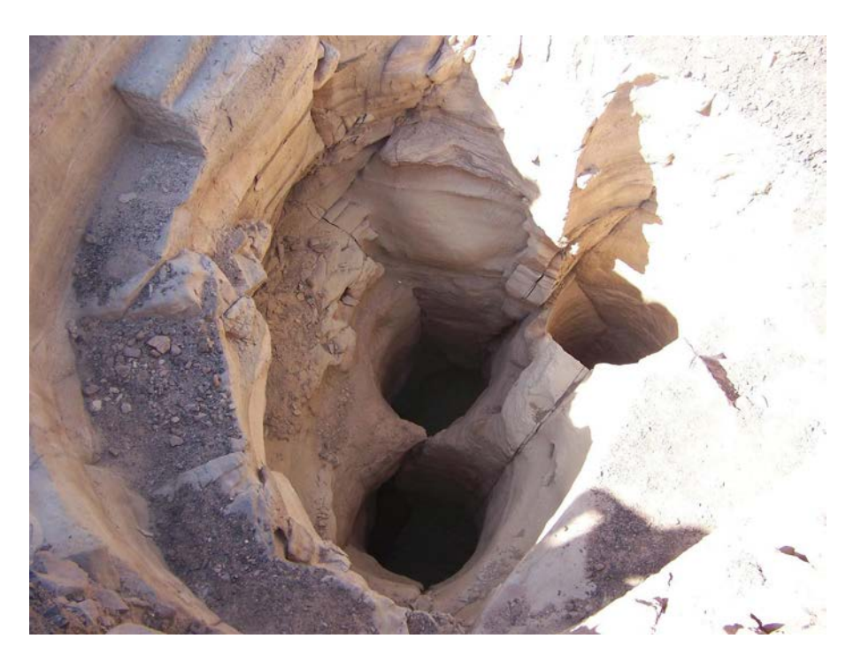
Fig 4. Wadi Khalid vertical mines, Faynan.

2007: 103, 122). The peak of copper production occurred in the late-tenth and ninth centuries BCE, the smelting taking place in the dry wadis close to the mines in locations where the industrial debris accumulated in huge slag piles, such as those recently excavated at Khirbet en-Nahas and Khirbet al-Jariya (Figs. 5, 6) (Levy, Najjar and Ben-Yosef, 2014).