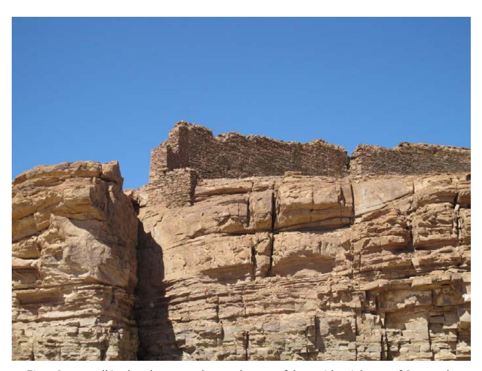
Fig 2. Stone wall in the plateau to the south-west of the residential area of Qurayyah.

arsenic copper can be dated to the last part of that millennium. There are still no dated domestic remains for this and the second millennium BCE, but there are several funerary structures and a pottery kiln dated to the mid-to-late sec-