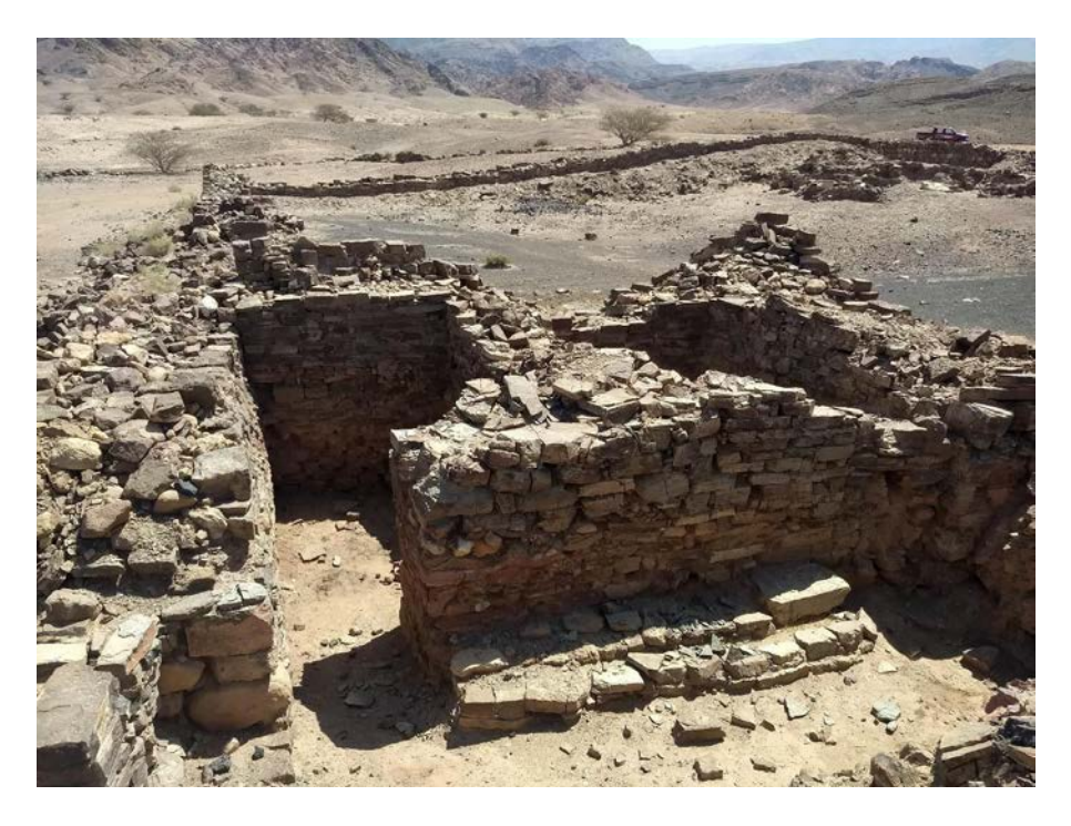
Fig. 6. Fortress gate and perimeter wall, Khirbet en-Nahas.