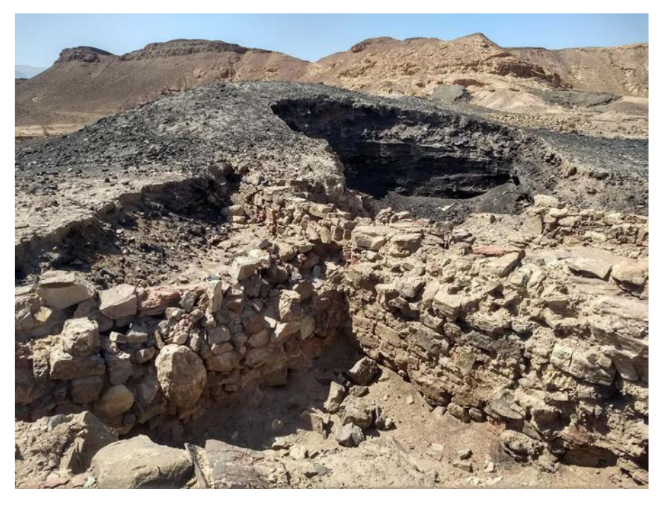
Fig. 5. Slag pile, Khirbet en-Nahas, Faynan.