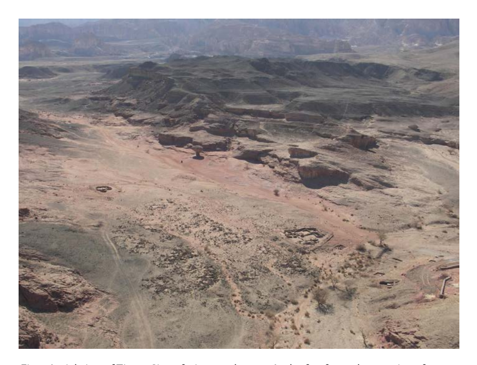
Fig 3. Aerial view of Timna Site 2 facing south-west. At the forefront, the remains of a copper smelting workshop. At the back in the left, the remains of an open courtyard shrine.

peoples having a more important role than previously thought. According to the new excavations and to novel radiocarbon data, an Egyptian phase did exist in Timna during the thirteenth-twelfth centuries BCE, as recorded by the remains of copper industrialization at smelting Sites 2, 3 and 35. However, the peak in copper production occurred only in the eleventh-tenth centuries BCE, after the Egyptians left the area in the late twelfth century BCE, a reality very apparent in Sites 15, 30 and 34 (Erickson-Gini, 2014; Ben-Yosef et al. , 2012; Ben-Yosef, 2018). A similar picture emerges from the recent and limited surveys carried out in the copper mines at Nahal 'Amram, to the south of Timna, where there is evidence of copper mining between the fifteenth and the tenth centuries BCE (Avner et al. , 2018).