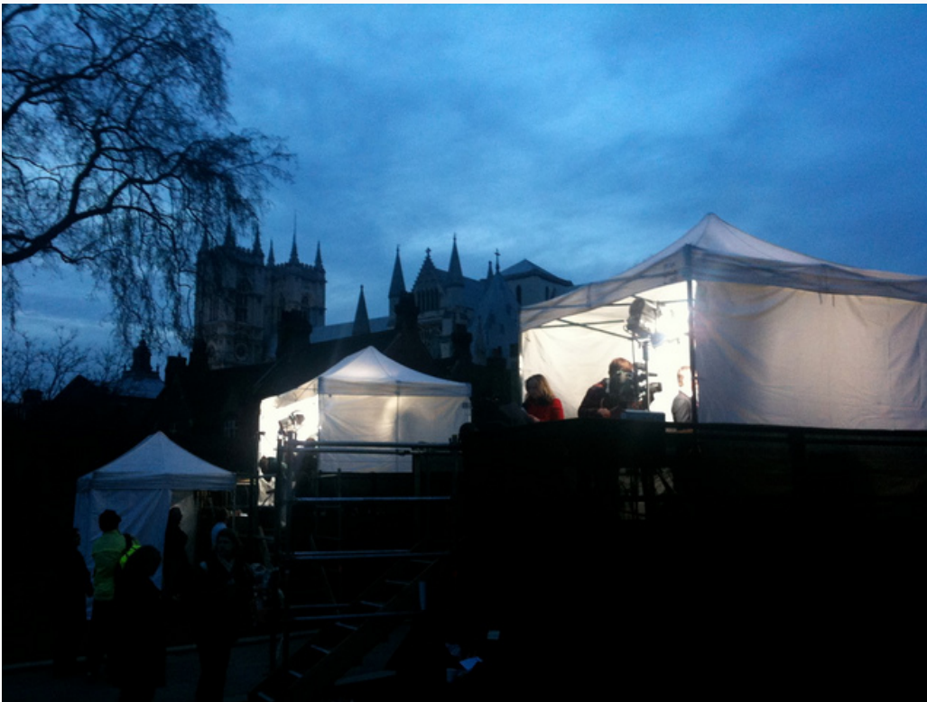
Election night surprise?

With the the 2015 election upon us, there is much talk of safe and marginal seats, and the main parties approach to each. In this post, Max Goplerud examines a perennial concern about the British electoral system—the prevalence of safe seats—using historical data and a new method for addressing boundary changes to illustrate the extent of the problem.