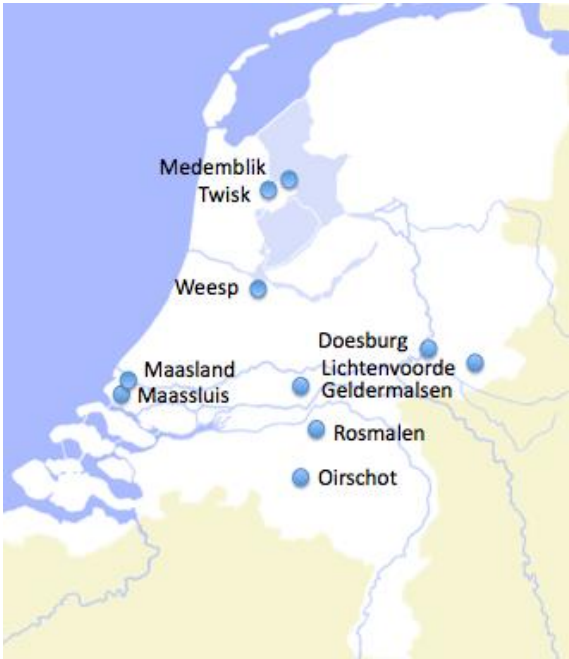
Figure 1 Locations in inventory sample