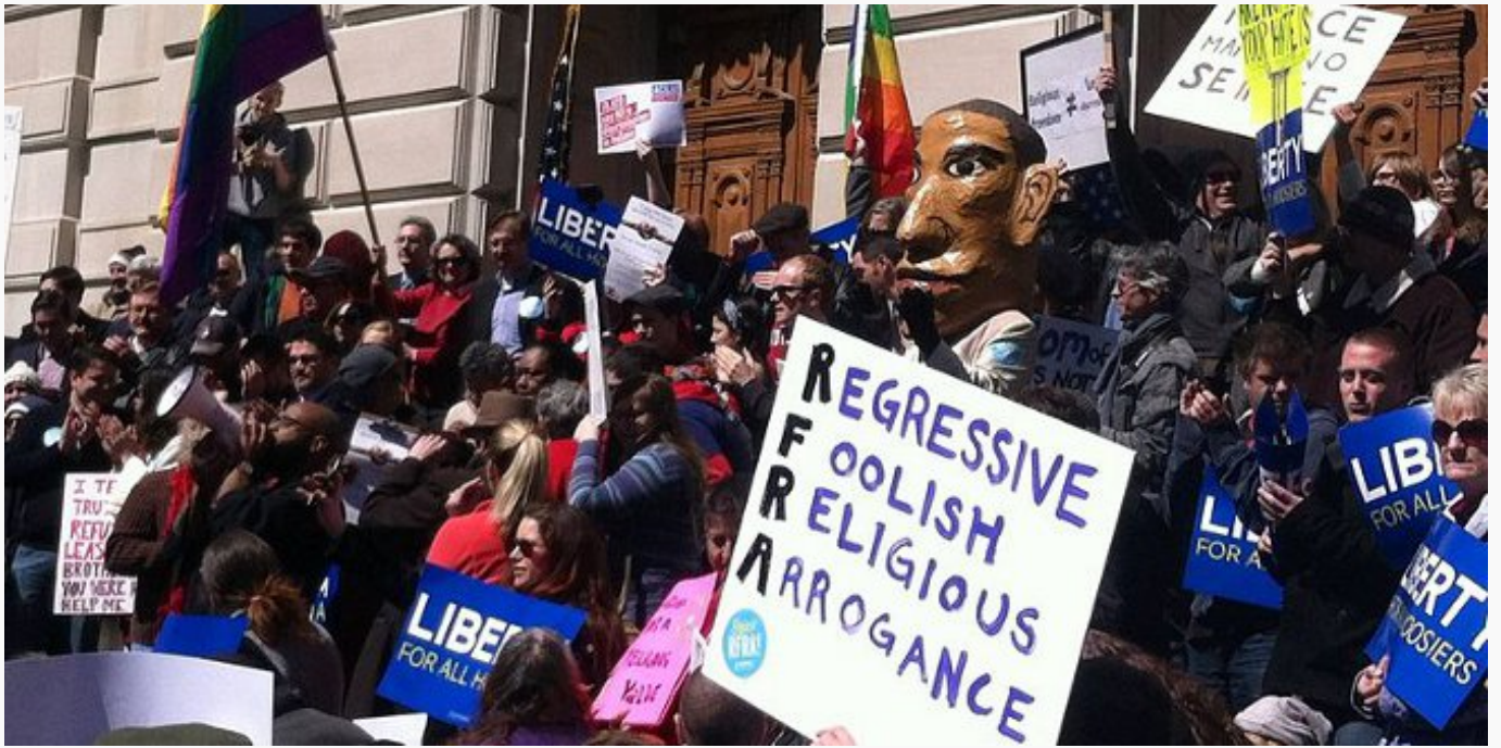
RFRA Protests in Indianapolis on March 28, 2015