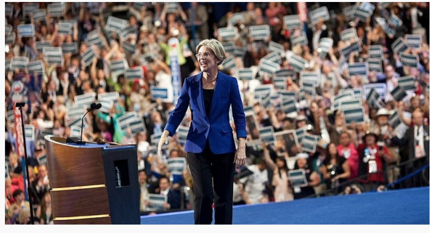
Senator Elizabeth Warren

There was drama even before the House met for its first session of the