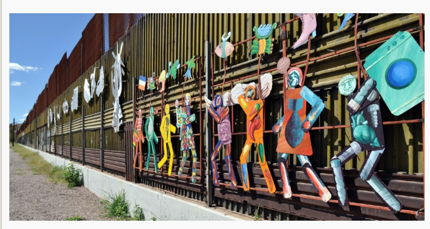
Border Wall Mural in Nogales, Mexico.

Wonkblog writes on Saturday that the Obama administration may be missing a major chance to boost enrollment in its Obamacare program. They say that while 6.4 million people have already signed up for health plans in 2015, having people sign up during the fall is a bad idea as for many, it is one of the most emotionally and financially stressful times of the year. Daily Kos, meanwhile, takes a look at Obamacare's 2014, from House