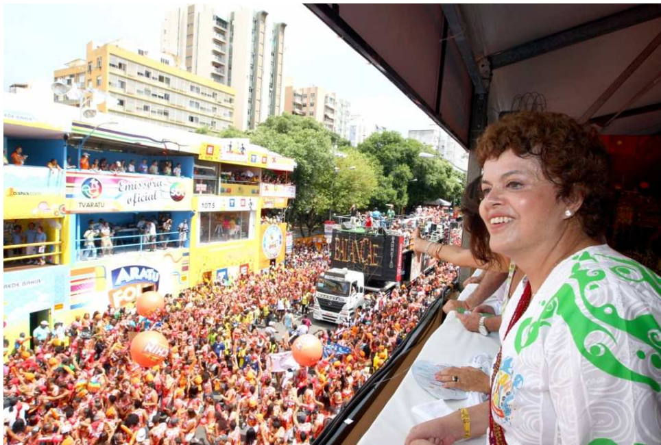
Dilma Rousseff in 2010.