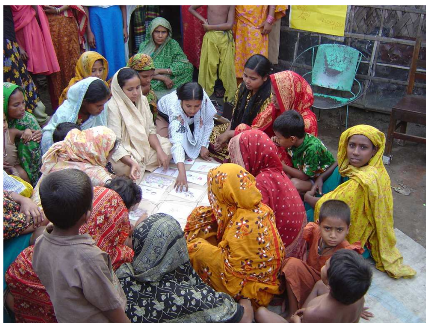
Credit: Health education in Dhaka by Waterdotorg (CC BY-NC-SA 2.0).

Secondly, the majority of CBOs appear to be externally-driven, especially regarding Water and Sanitation (WASH). Whilst this is by no means disempowering, this does have implications for the sustainability of CBOs formed or supported by NGOs and donors.