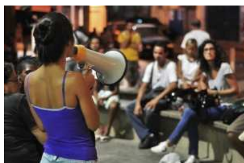
Youth-led plenary to debate local demands at Complexo do Alemão in March 2014. The plenary led to online debates and the writing of a manifesto.

Media collectives are often small groups of activists formed on the basis of personal affinity and sociopolitical interests. They usually combine online interactions and networking with localised actions with favela communities. For instance, Favela em Foco is a photography collective that uses online social networks and localised interventions (e.g. photo and film exhibits) to document, publicise and mobilise culture and politics in favelas. Ocupa Alemão is a youth collective that avidly uses social networks online to articulate debates, demonstrations and cultural events in the favelas of Complexo do Alemão. Cafuné na Laje , in turn, is an independent video producer that uses critical pedagogical strategies to produce participatory videos with children from different favelas.