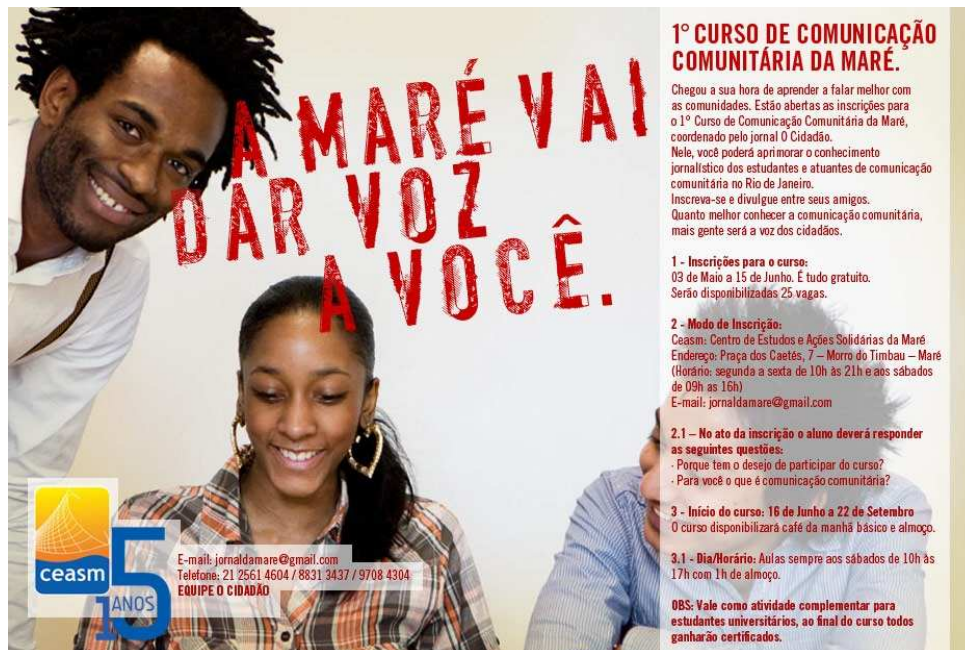
“Maré will give you voice”: Poster circulated online announcing the first community media course at O Cidadão in 2012.

Media collectives are often small groups of activists formed on the basis of personal affinity and sociopolitical interests. They usually combine online interactions and networking with localised actions with favela communities. For instance, Favela em Foco is a photography collective that uses online social networks and localised interventions (e.g. photo and film exhibits) to document, publicise and mobilise culture and politics in favelas. Ocupa Alemão is a youth collective that avidly uses social networks online to articulate debates, demonstrations and cultural events in the favelas of Complexo do Alemão. Cafuné na Laje , in turn, is an independent video producer that uses critical pedagogical strategies to produce participatory videos with children from different favelas.