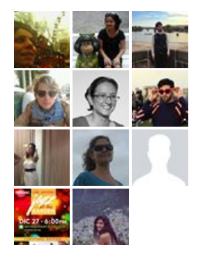
Facebook social plugin