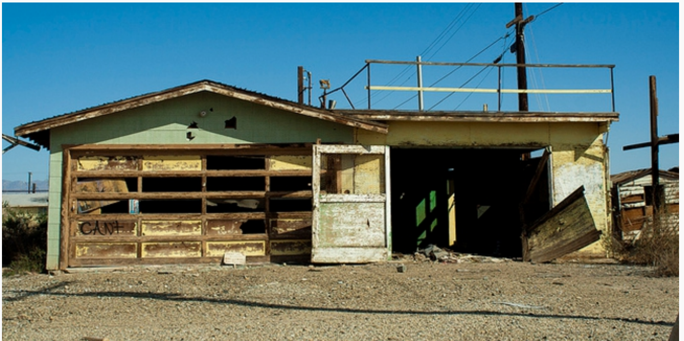
Figure 2 – Vacant Home in California