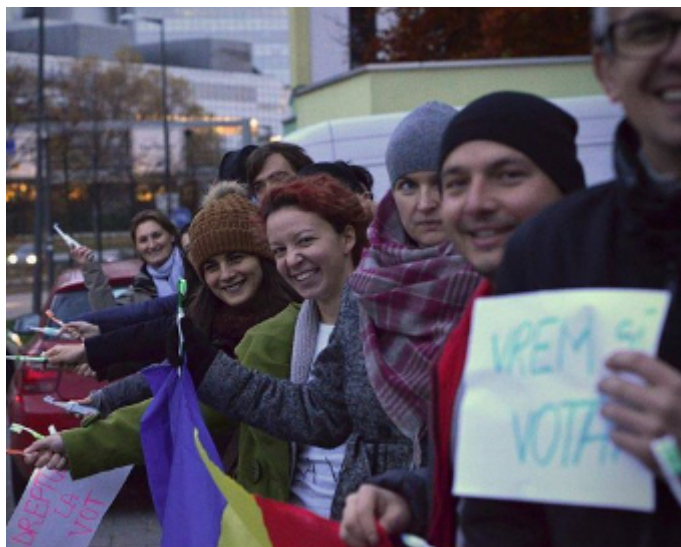
Romanian voters in Munich, Credit: Madalina Rosca (CC-BY-SA-3.0)

Ponta's campaign served to reinforce the view that it was the same old PSD, with a populist spin openly advocating the 'second great unification' of Romania and Moldova by 2018. This is nothing new: Băsescu and his predecessors have all invoked the nationalist reunification card to inspire votes, both at home and among Romanian citizens in Moldova (of whom 36,000 voted in the second round, twice that of 2009). However, it had never been articulated by these politicians with a specific timetable, nor did they make it a central plank of their discourse.