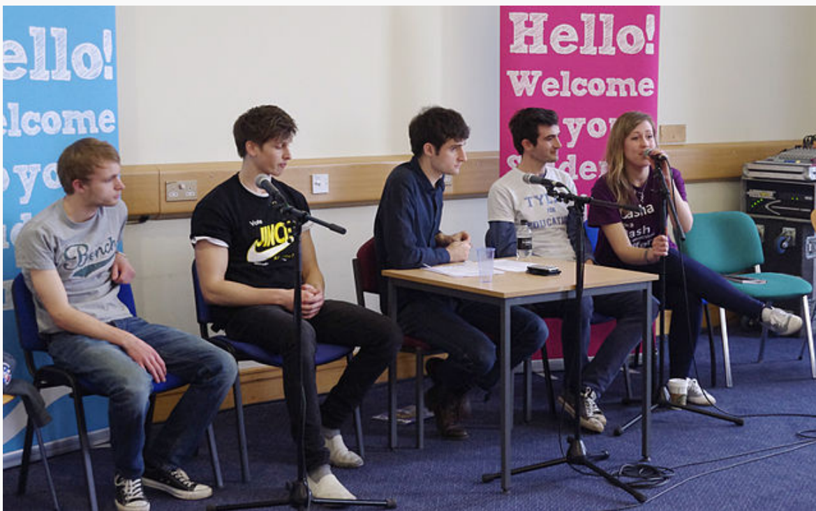
Would local Question Time-style events and youth surgeries help engage young people?